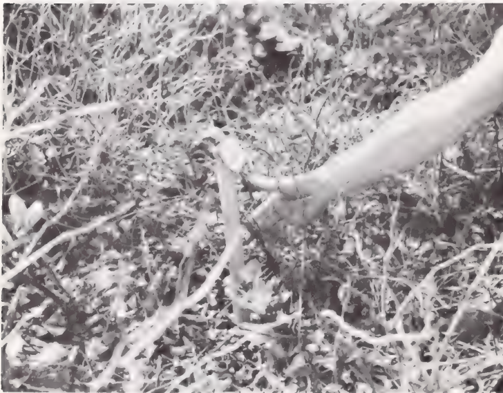
Figure 3.--Budbreak sprays of dicamba plus 2,4,5-T produced good control of salal on small plots.

Few plants were killed by budbreak sprays, and salal cover will be quickly reestablished from root and basal sprouting. However, silvex sprays may produce sufficient control of salal for conifer release. Silvex should be evaluated in small-scale aerial spray tests before specific treatments can be recommended. For site preparation, sprayed plants should be removed by scarification or burning to avoid planting in the dense mat of salal stems and roots. Because of the dense, compact growth habit of salal, low volume aerial sprays will not produce results equivalent to those obtained with high volume ground sprays. Therefore, carrier volumes between 15 and 30 gallons per acre should be evaluated in aerial spray tests.