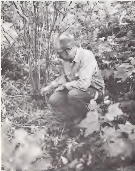
Figure 2.--Budbreak sprays of dicamba with silvex produced good topkill of California hazel shrubs.

Previous research shows that California hazel shrubs are slightly more susceptible to late spring foliage sprays of 2,4,5-T than to budbreak sprays (Stewart 1974). However, control with budbreak sprays of 1 lb ae each of 2,4-D and 2,4,5-T or 2 lb of 2,4,5-T are adequate for release of established conifers, and herbicidal damage to conifers will be less than with foliage sprays. Combinations of dicamba with 2,4,5-T or silvex may be useful for site preparation and preburn desiccation sprays. However, these combinations must be evaluated in small-scale trials before they can be recommended.