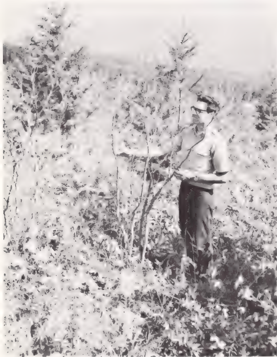
Figure 1.--A budbreak spray of 2,4,5-T in diesel oil killed this vine maple shrub.

Vine maple shrubs were very susceptible to budbreak sprays of 2,4,5-T and silvex (table 4 and fig. 1). Although silvex was slightly more effective, it is more expensive, less selective, and more erratic on species often associated with vine maple than is 2,4,5-T. Lauterbach (1961) recommends aerial sprays of 2 lb ae of 2,4,5-T per acre applied in a diesel-oil carrier at budbreak to release conifers from vine maple. Foliage sprays (Stewart 1974) or budbreak sprays containing dichlorprop, dicamba, or combinations of phenoxy herbicides with dicamba are less effective than the recommended treatment. Therefore, budbreak sprays of 2,4,5-T should continue to be used for control of vine maple shrubs.