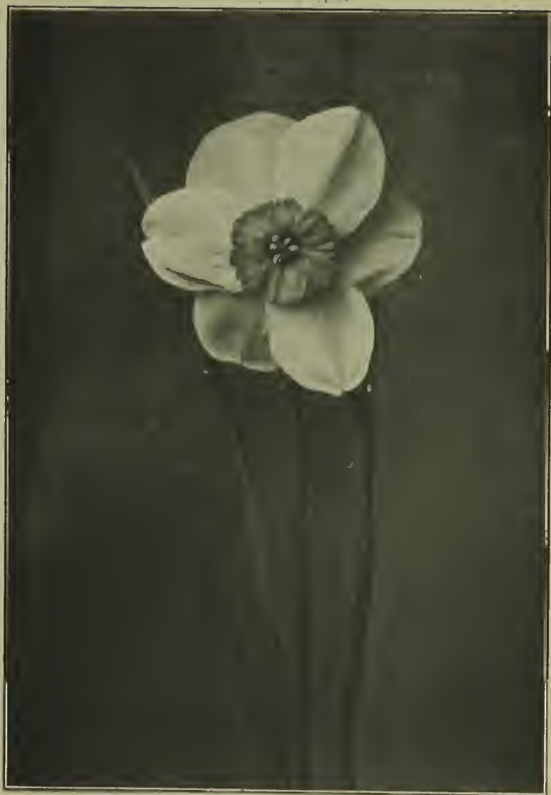
Narcissus "HENRY JAMES."

The most striking Novelty of 1911. See page 33