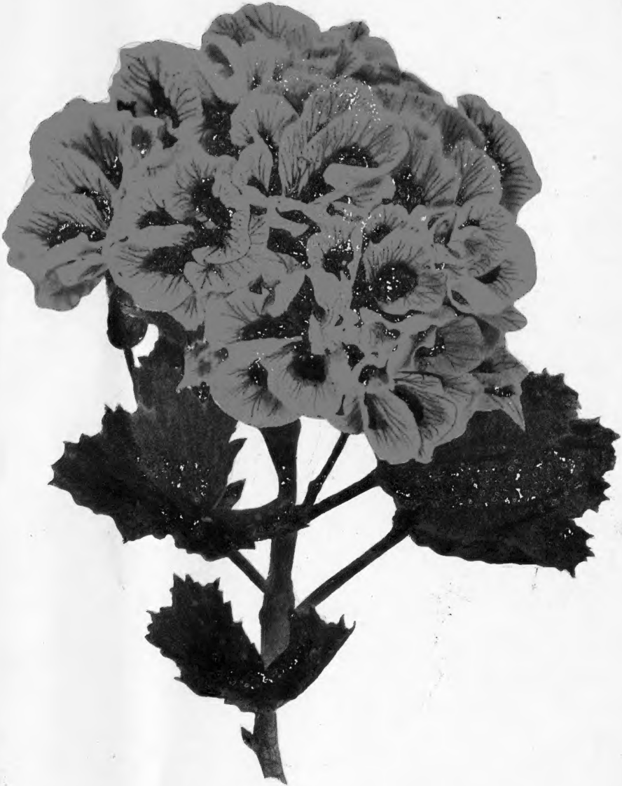
WURTEMBERGIA SPORT OF EASTER GREETING (AN IMPROVED EASTER GREETING)