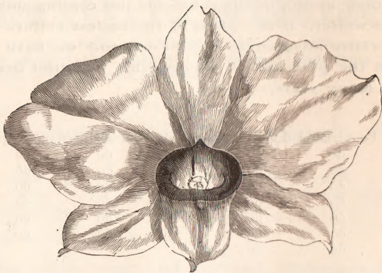
DENDROBIUM PHALÆNOPSIS SCHRODERIANUM.