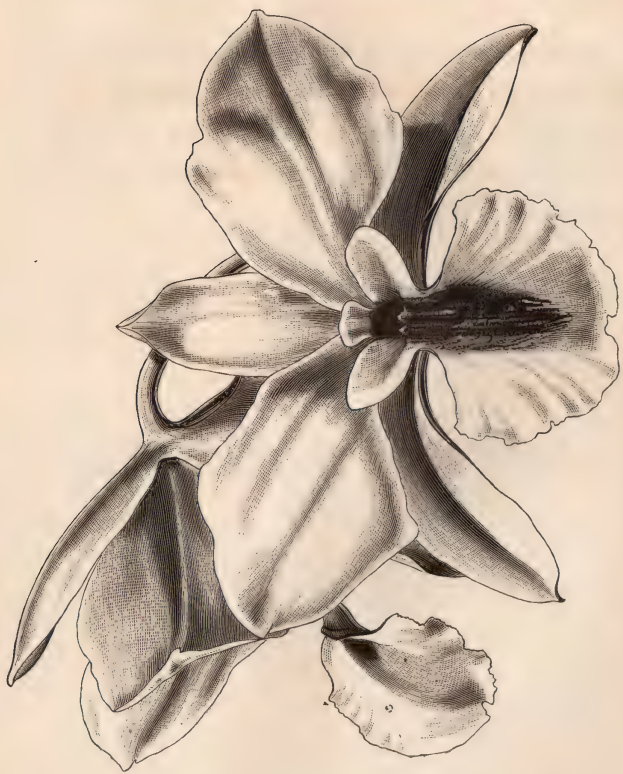
DENDROBIUM FORMOSUM GIGANTEUM.