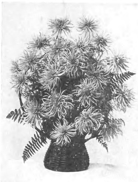
CACTUS DAHLIA Pink Abundance