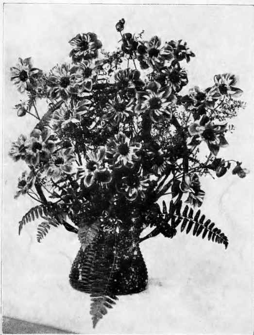
NEW COLLARETTE DAHLIA ® CONTINENTAL