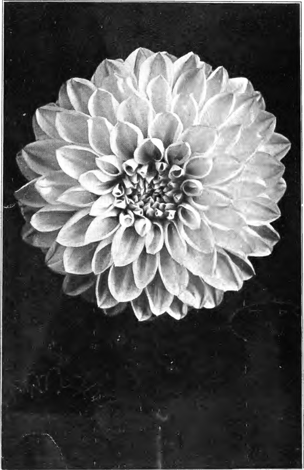
AYESHA (GIANT DECORATIVE)