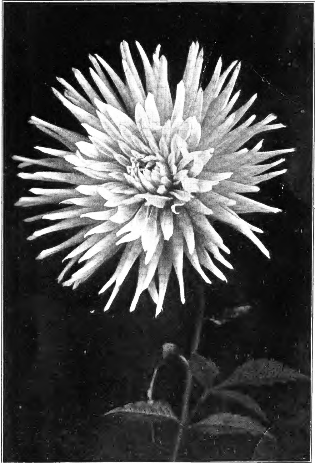
MARGUERITE BOUCHON (CACTUS)