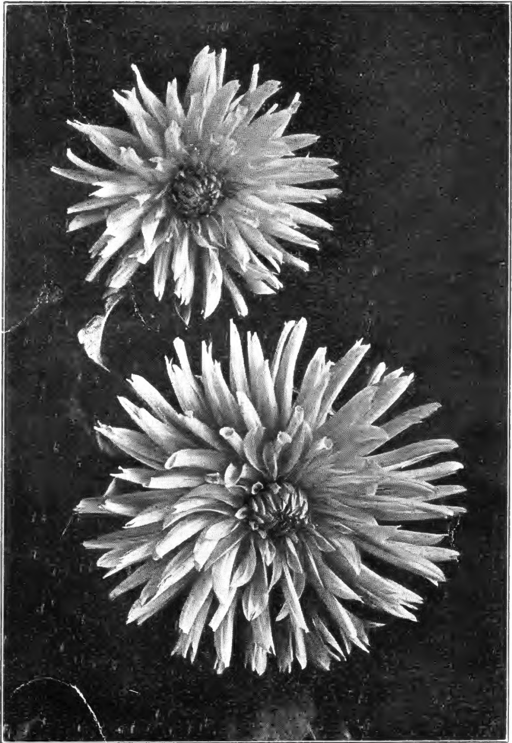
NIBELUNGENHORT (COLOSSAL CACTUS)