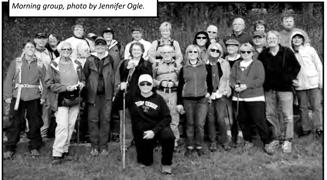
Morning group, photo by Jennifer Ogle.

When we came to a small dry creek bed we found three species in the Nettle Family-clearweed ( Pilea pumila ), false nettle ( Boehmeria cylindrica ) and wood-nettle ( Laportea canadensis ). While a very nice find to see all three species in one area, what interested us were the black and white spikey caterpillars munching on the leaves. Luckily we had a butterfly expert along who informed us they were the larval stage of the red admiral. For me this brought everything home. We all enjoy native plants for their beauty and intrinsic value, but ultimately they serve a far more important function. They provide food and shelter for hundreds and thousands of insects, like the red admiral, who will go on to pollinate, not only native plants, but also our food crops. The loss of pollinators can be attributed to many factors, but most experts agree that the loss of native habitat is the number one cause. Not to be overly dramatic, but understanding this concept is critical to our survival. Nature doesn't need us, we need nature.