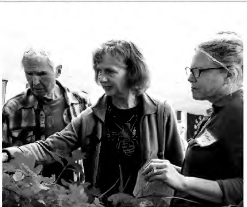
Right - Bidders examine hard-to-find native plants prior to start of the auction.