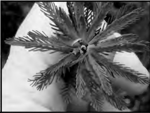
Parrot's Feather, Myriophyllum aquaticum , photo by Virginia McDaniel.

During the Lower Ordovician Period, approximately 485-443 million years ago, Arkansas was covered by a shallow sea. Layers of dolomite and limestone were forming on the sea floor as trilobites and other creatures we only know from the fossil record inhabited the waters. But one organism that existed during that time still exists today: Stromatolites! Stromatolites are "layered bio-chemical accretionary structures" that form in shallow water whereby sedimentary grains are layered and cemented on top of each other by biofilms of microorganisms like cyanobacteria. These phenomenal organisms have inhabited the earth for 3.5 billion years!!!! Living stromatolites were discovered in Shark Bay, Western Australia in 1956 and continue to be found around the world, like in the thermal pools in Yellowstone National park. We had the opportunity to see fossilized stromatolites on the walk at Lake Leatherwood City Park during our fall meeting. Neat!