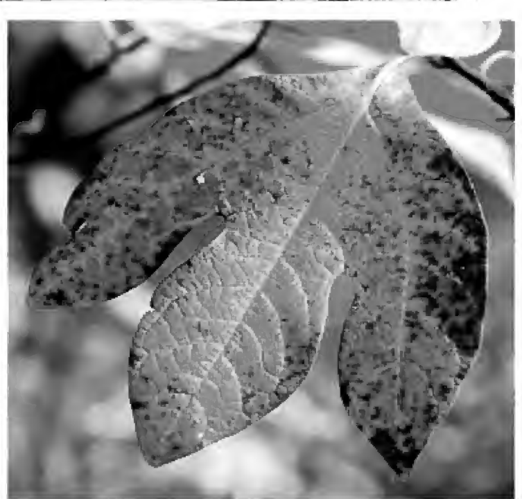
Clockwise from top left: Lion's Mane ( Hericium erinaceus), Paw-paw enjoyment, The Mother Lode of Paw-paws ( Asimina triloba), Sassafras ( Sassafras albidum), Spicebush ( Lindera benzoin).