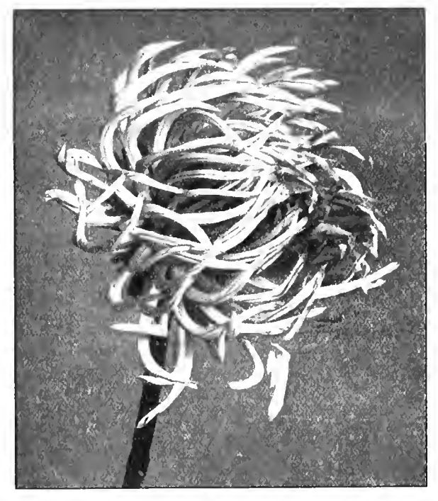
Photo.] CACTUS DAHLIA (much reduced). [Clibrans. Side view of bloom, showing long, incurving petals.

Of all sections of Dahlias the Cactus-flowered varieties are far and away the most popular. They embrace the widest range of colour, are generally of good habit, and very floriferous. The flowers consist of long, narrow, pointed florets, each floret being reflexed at the edges, giving it the appearance of a long, narrow claw. They are most popular for exhibition, garden, or room decoration.