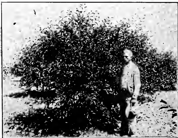
CHERRY TREE—THREE YEARS OLD