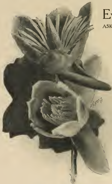
Flowers of the Tulip Tree

This class includes several species that require special care in transplanting. Failure to observe their sensitive requirements leads to loss and disappointment. We are prepared to handle such sorts according to their several peculiar requirements with every assurance of success.