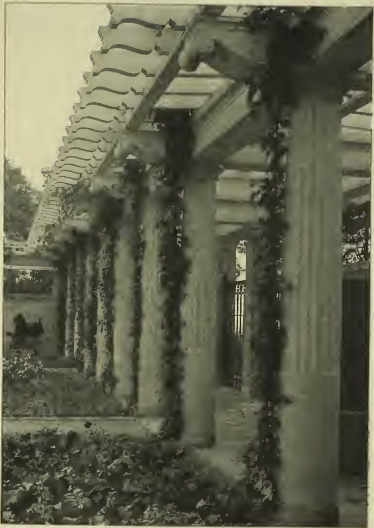
Pergolas and Walled or Hedged Hardy Gardens are Specialties with the Dayton and Xenia Nurseries