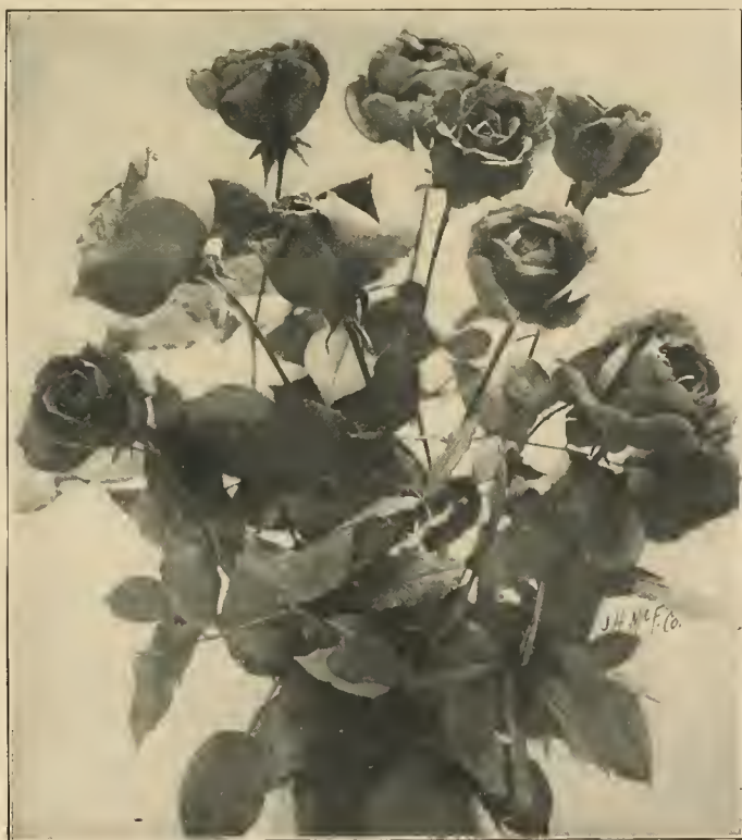
Hybrid Tea Roses

Special attention is given to the preparation of rose-beds—one of the requisites to success with garden Roses.