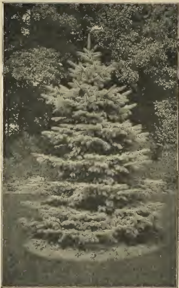
Colorado Blue Spruce