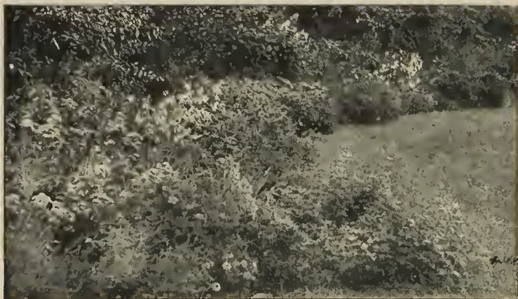
Border of Hardy Perennials