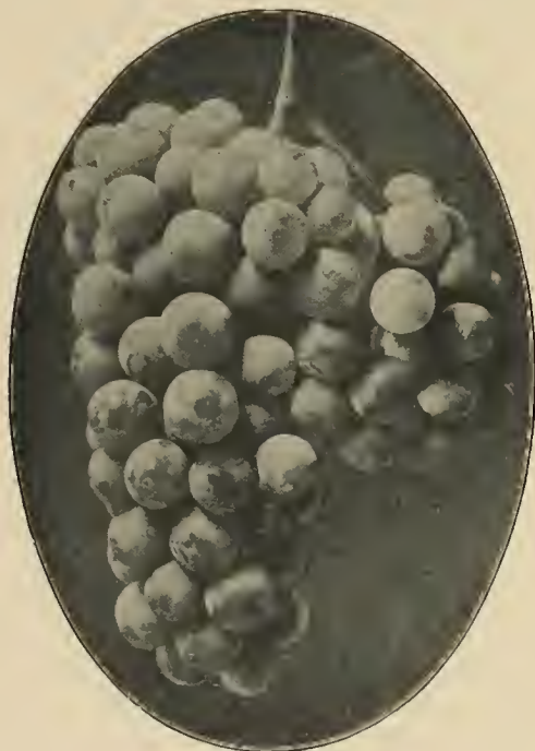
Green Mountain Grape

In this class we offer only such varieties as are suited for city and suburban planting. Parties desiring to plant for commercial purposes should write us. Both tree and small fruits may be successfully and even profitably grown on the city lot. A bed of Asparagus is a source of pleasure.