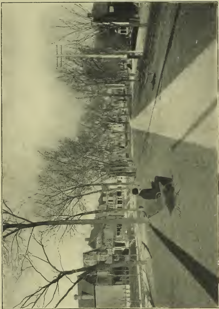
North Boulevard, Dayton, Ohio