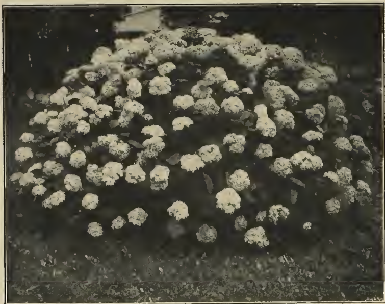
Hydrangea arborescens , var. sterilis , (Hills of Snow)