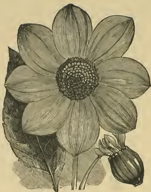
NEW SINGLE DAHLIA. — (See p. 4.)