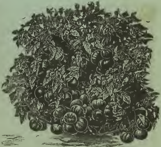
Dwarf Champion Tomato.