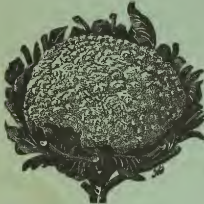
Henderson's Early Snowball Cauliflower.

The experience of years shows it to be unexcelled by any variety for earliness. If planted March 1, large-sized heads will be produced early in June, about one week earlier than other varieties, and scarcely a single head will fail to form. The outer leaves are short, so that the plants may be set from eighteen to twenty inches apart, thus allowing the planting of from twelve to fourteen thousand heads per acre. Its compact habit of growth renders it a peculiarly profitable variety to force under glass, and it does equally well, also, for late planting. 15 cts. per pkt., $1 per 1/4-oz., 3$ per lb.