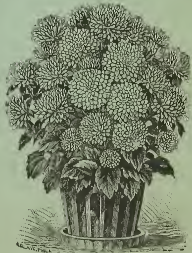
Truffaut's Peony-flowered Aster.