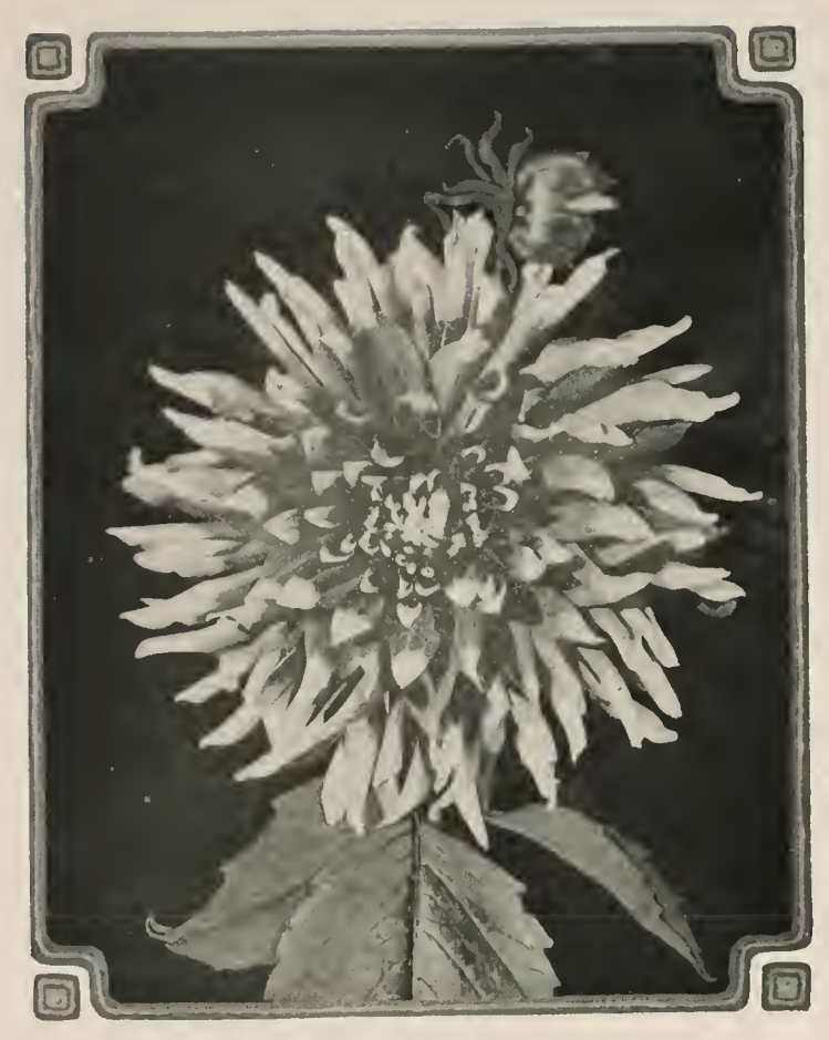
THE NEW MOON—(Burns)

This superb Dahlia is without question the rarest novelty in the Dahlia world today. A hybrid cactus type, color canary yellow nearly always with white tips. A very free bloomer, straight stems and it possesses all good points both for exhibition and garden work. Awarded First prize for the best established seedling in Dahlia Society of California show 1920. $5.00 each