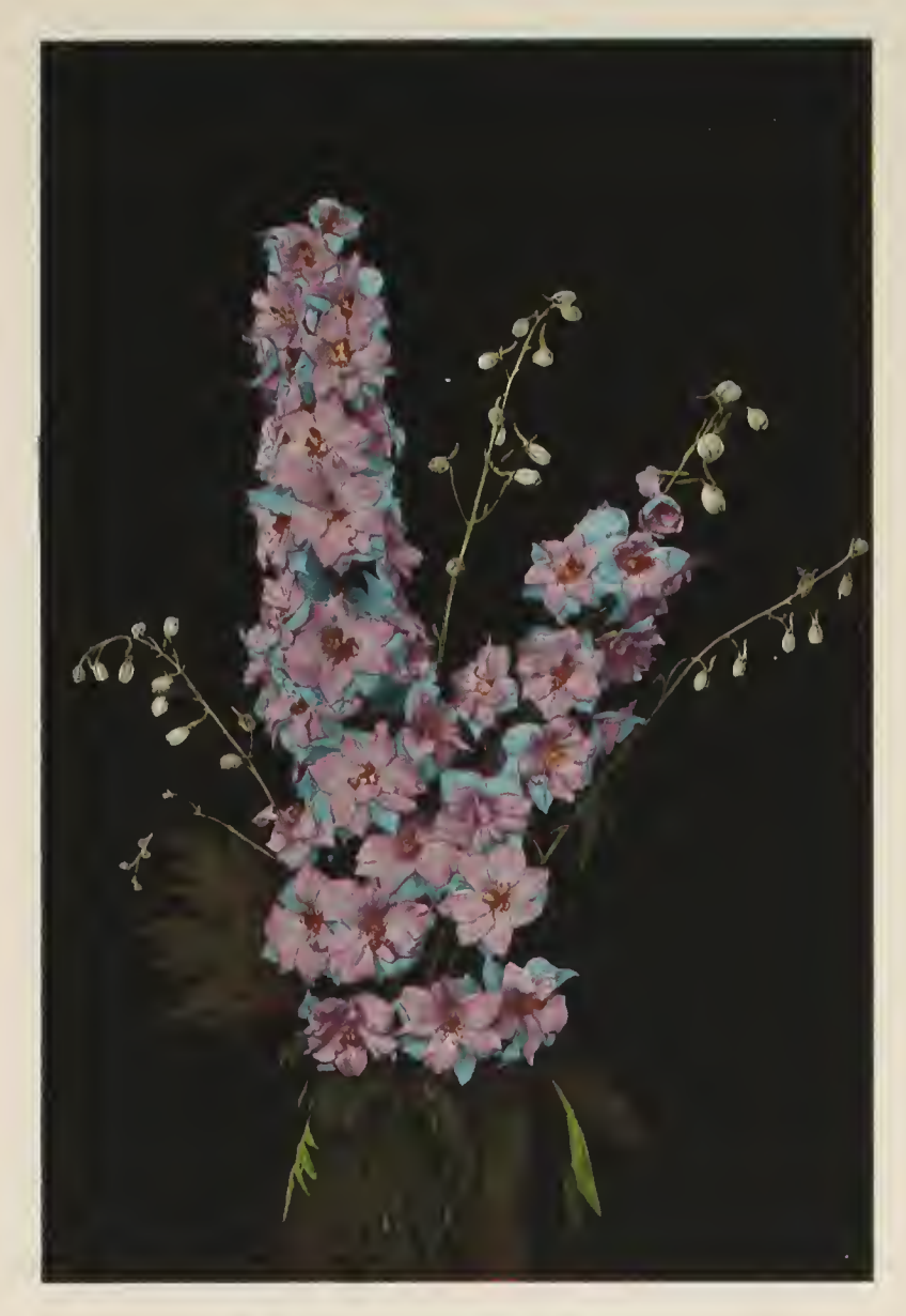
THE BURNS NEW HYBRID DELPHINIUM (SEE DESCRIPTION PAGE 2)