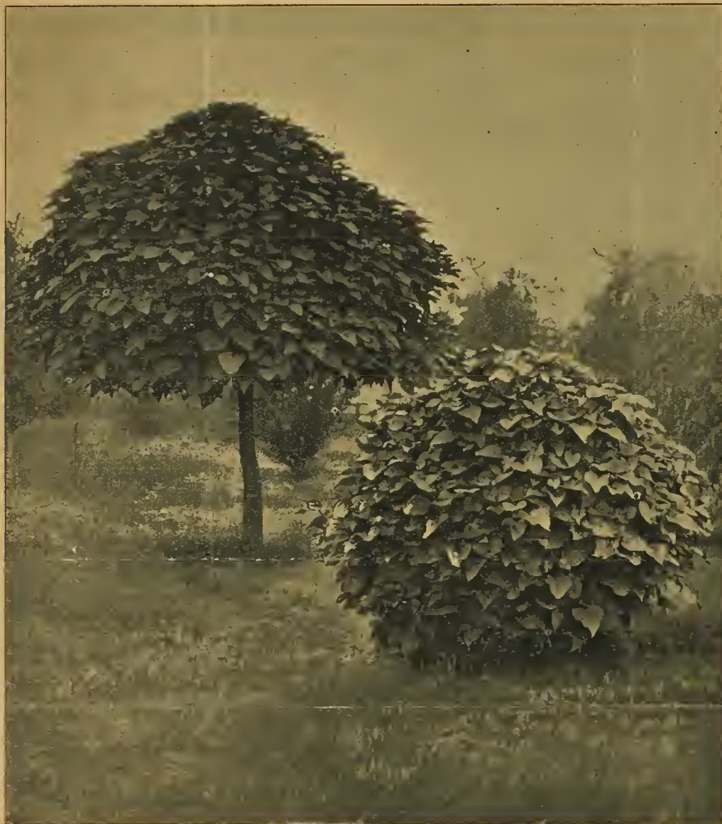
THE CATALPA BUNGEI ON ITS OWN ROOT AND AS AN UMBRELLA TREE.

The trees here represented are growing in the park of the U. P. R. R. at Lawrence, Kans., the photos were taken the last week in August, 1894 when the drouth had been so severe as to dry every spear of grass in the lawn, yet the leaves on the trees were as fresh and green as if such weather was congenial. The trees have been planted four years, the standard tree 7 1/2 inches to the branches which have a spread of 13 ft. The tree is 8 in. diameter 1 ft. above ground, and the view is from its west side. They grow here erect, they stand against the prevailing south wind. Most trees here grow and the north because of south winds of the trees grow alike on all sides. The fruits and leaves are very compact of a very refreshing green and most stylish. The tree top which is very unique and always consistent; they are hardy in most climates and soil prefer a deep rich soil, and are very well suited on both sides of the continent those who have reason to believe where they speak P. & E. of the season of the year, and this tree is the perfect tree when better known, will certainly be a great favorite for lawns and ornamental grounds. It forms a perfect half globular or umbrella head of a very deep green color. Their style is altogether new, unlike any other tree, and assume that shape without the aid of a knife. They are