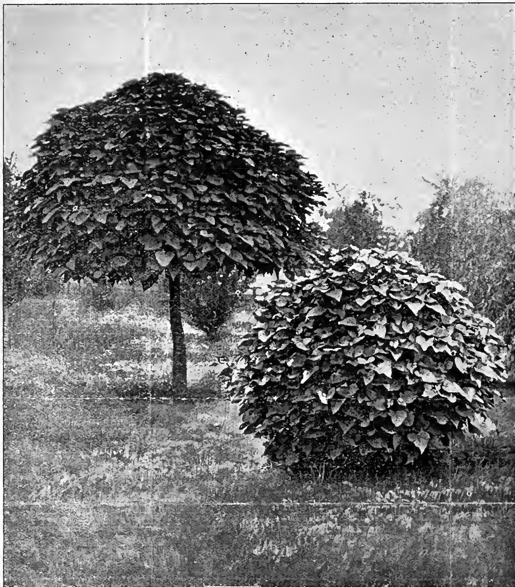
THE CATALPA BUNGEI ON ITS OWN ROOT AND AS AN UMBRELLA TREE.

From a nurseryman's standpoint they are desirable because they can be grown anywhere apple trees grow, and will reflect credit on the nursery that grew and sold the trees, for years to come. They are a tree needing no pet care to grow them, no disease or insects infest them, they are beauties grown alone or in clumps, along drive ways or borders. They cast a distinct shadow, can be grown any height of stem desired to suit the place or fancy for effect, in short it fills more the ideal of a progressive man's idea of a tree for home adornment than any other the writer knows of. The stock for these should always be the Hardy Speciosa or Teas Hybrid; the Big-noides are not hardy.