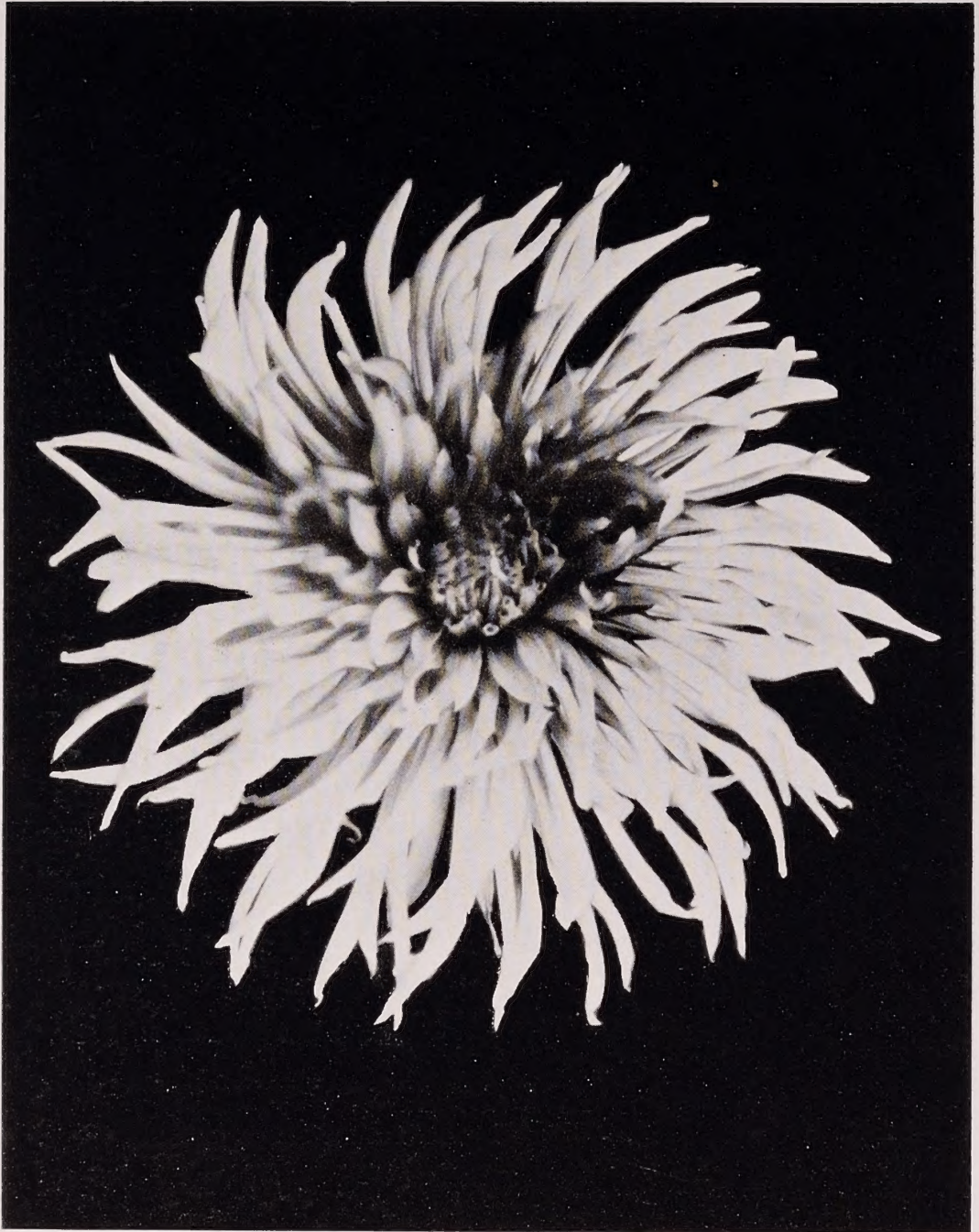
New Cactus "Ballet Girl"