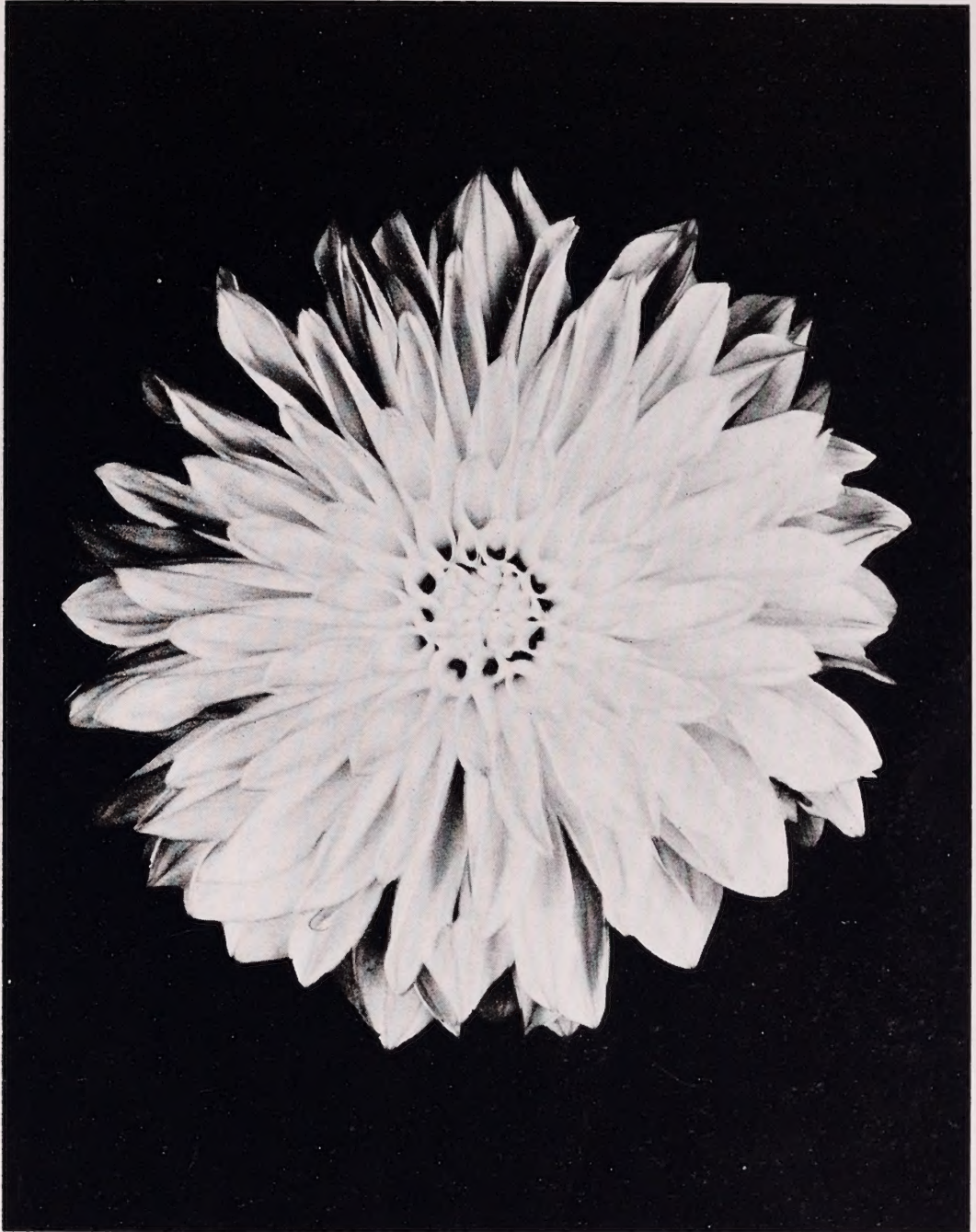
New Decorative "Mabel B. Taft"