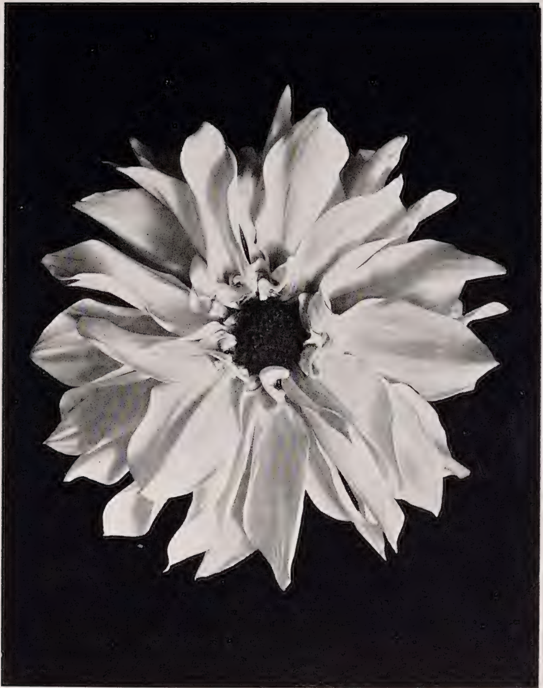
New Peony "Blossom"