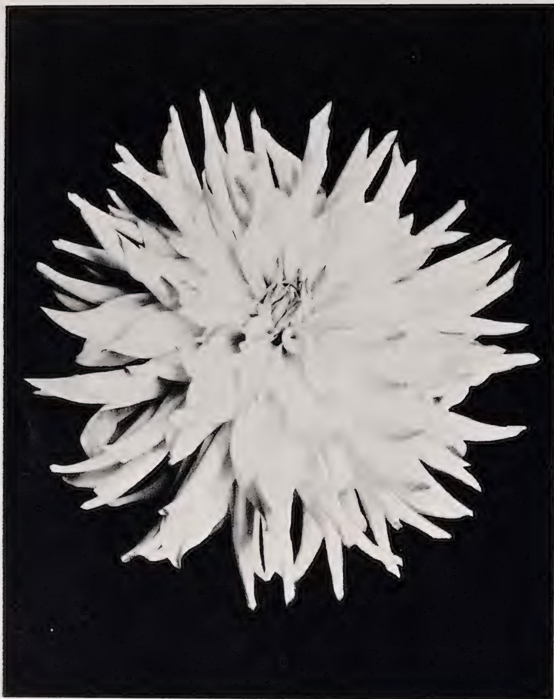
New Hybrid Cactus "California Enchantress"