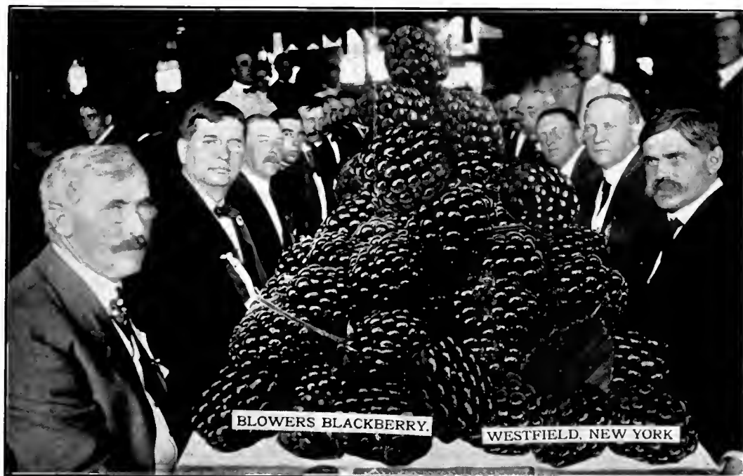
"A Festive Board."

These are Judges and Ministers and those who make our laws and execute the same, who educate our children, distribute our mail, do our banking, sell our fruit and protect us from fire. They know a well Ladden Table.