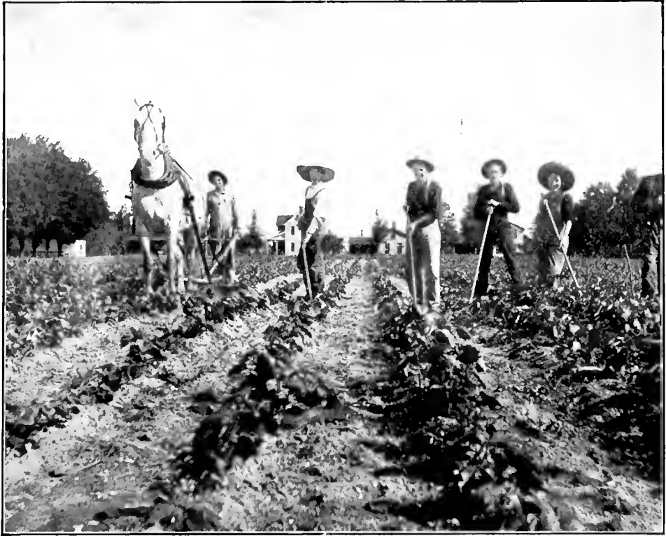
"Cultivating Blowers Cuttings"