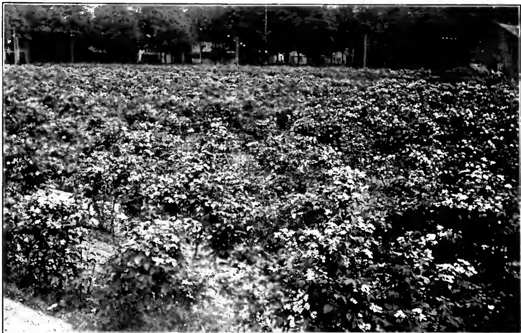
"Blowers Black Berries in Blossom"