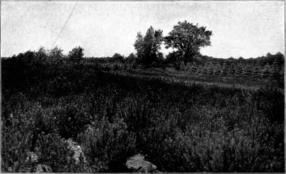
Block of Pinus mughus specimens at Boxford-Highlands Nursery

Deliveries by truck are prompt and safe, and place the specimens at the right spot. The cost is reasonable.