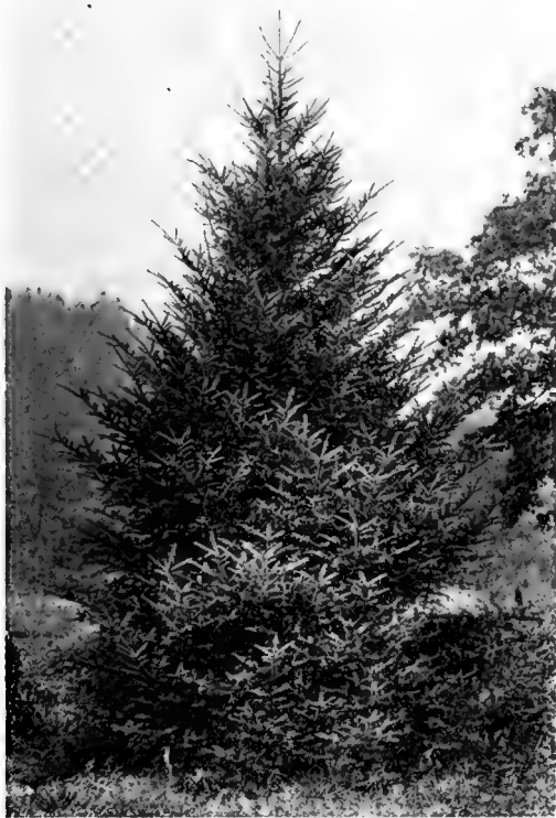
Specimen Fraser's Fir on Grounds of Highlands Nursery