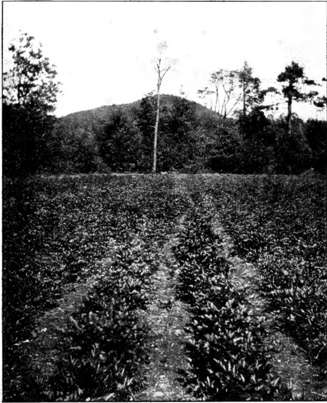
Rhododendron catawbiense (true species) growing by thousands at Highlands Nursery, 3800 ft. elevation in the Carolina Mountains.