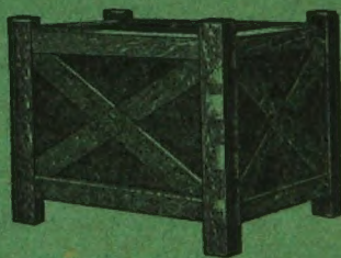
Style of Nos. 1 and 2