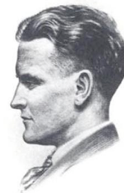
F. Scott Fitzgerald

Amory Blaine is a product of a wealthy family and an Ivy League education. Without a need to learn a profession, he dabbles in literature and partying with his like-minded school chums. World War I intervenes in this happy fog and brings focus to some, doubt to others.