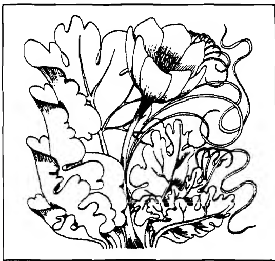
Bloodroot: named for the orange-red juice in its roots and stem (illustration from Durant, 1976).

The classic example of the Doctrine of Signatures is the Hepatica . With its three-lobed leaves, it was thought to be useful in liver disease, a remedy that was used for centuries. In fact, a boom in liver tonic in the 1880's led to the consumption of over 450,000 pounds of this plant in a single year. Bloodroot, Sanguinaria canadensis , is named for its bright red or orange sap - obviously a sign for illnesses of the blood. Even its Latin name is derived from the word for blood. This plant is currently used commercially in some toothpastes and anti-plaque dental rinses. Eyebright ( Euphrasia nemorosa ); at one time used