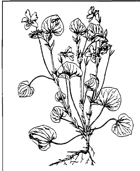
American Dog Violet ( Viola conspersa ), a rare species on L.I. occurring at Shu Swamp Preserve

The Lily Family, Liliaceae, with its flower parts in 3's is well represented. Trout Lily, Erythronium americanum , carpets the forest floor with its mottled leaves. Always more leaves than flowers (it takes 7-8 years for a trout lily bulb to mature to flowering size), still one can find concentrations of these delicate creamy-yellow, 6-petaled lilies often at the base of the tulip tree trunks. Wake Robin, Trillium erectum , adds its deep maroon red; and in a few places one can find the white form, album , as well as intermediate hues. Wild Oats, Uvularia sessilifolia ,