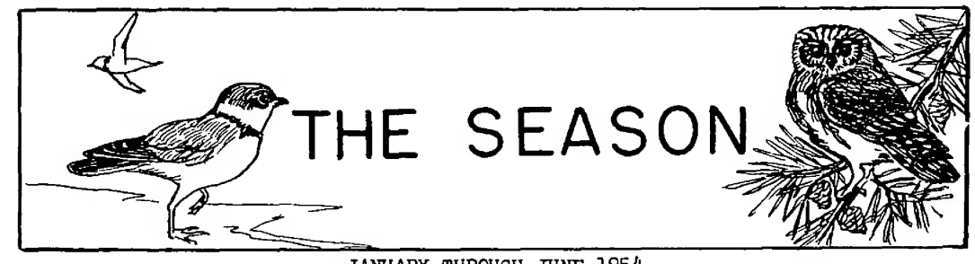
JANUARY THROUGH JUNE 1954