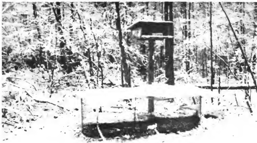
Fig. 2. All-purpose trap in operation at Monkton.

Returns are those birds that are retrapped at the station after an absence of 90 days or more. Table 1 lists the returns by species.