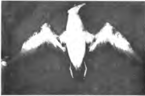
Audubon's Shearwater.

One day this past summer while rummaging through the freezer at the headquarters of Assateague Island National Seashore, examining a variety of salvaged animals being saved for possible future use by the park, I stumbled onto a small black and white tubenose which I identified as an Audubon's Shearwater ( Puffinus lherminieri ). The specimen had been buried in the freezer for over two years, but was tagged as being found, "dead on the beach with car tracks around it," on August 1, 1970, one mile north of the Virginia state line, by R. E. Fawley, a park employee.