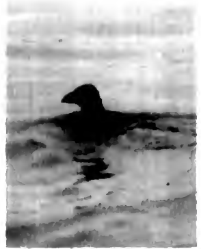
Immature Atlantic Puffin 51 miles ENE of Ocean City on March 16.

During the winter of 1975, the Atlantic Puffin was the "most common" alcid observed on pelagic trips off Maryland. All of these observations were made beyond 40 miles from shore. In fact, it became apparent on the EPA/Coast Guard cruise off Delmarva, as we zig-zagged back and forth from 15 to 50 miles off shore, puffins could almost be expected once we were more than 40 miles out. Other species that were seen only beyond 40 miles were small numbers of Dovekies ( Plautus alle ), Red Phalaropes ( Phalaropus fulicarius ), and Great Skuas ( Catharacta skua ) 1 .