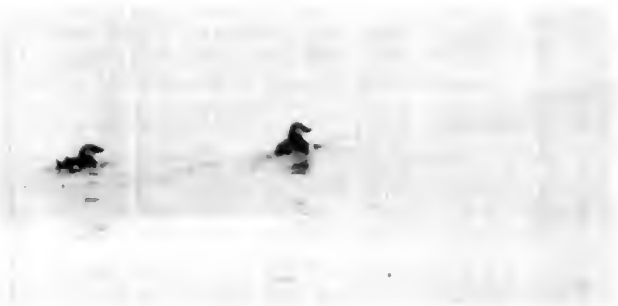
Two immature Atlantic Puffins on a glassy calm Atlantic on March 16, 51 miles ENE of Ocean City, 38°22'N, 74°02'W.

A summary of the oceanic species and numbers observed during the nine days spent at sea off Delmarva from January through March, 1975, is presented in Table 1.