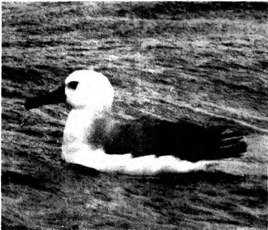
Yellow-nosed Albatross resting on the water beside the boat.

and wind to rise into the wind, coast across it, banking ventral side to us, lose altitude but gaining speed, dip to the leeward, bank to turn, rising into the wind once more, then repeat this cycle or land on the water again. Usually, these flights lasted less than five minutes.