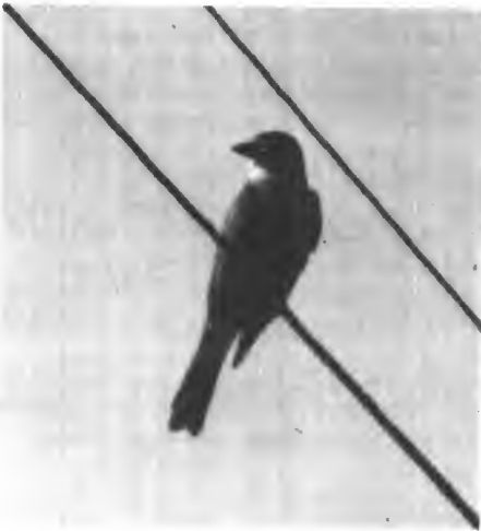
Gray Kingbird at Girdletree, Md.

The weather for the previous several days had been inconclusive. A warm front beginning as a stationary front along the Georgia coast on Monday, June 9, finally started moving up the coast on Thursday, only to be pushed offshore by a cold front very early Friday morning. The winds behind the warm front were light and southerly. The winds behind the cold front were moderate northwesterly and by Friday night had become light and variable. There had been light to moderate WSW winds Thursday, Friday, and Saturday, June 5-7, but a cold front Sunday the 8th changed the wind direction to northwest.