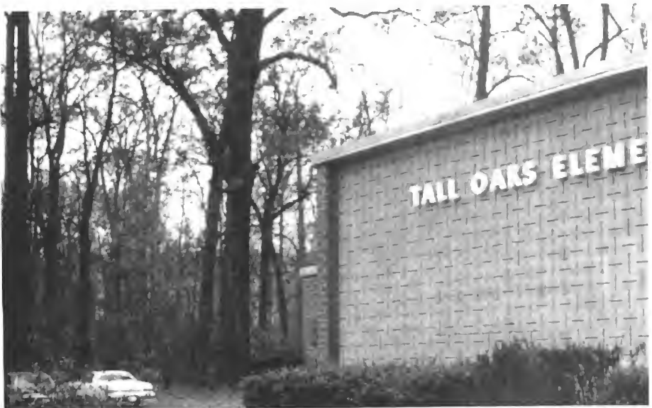
Fig. 1. North woods after removal of large trees.