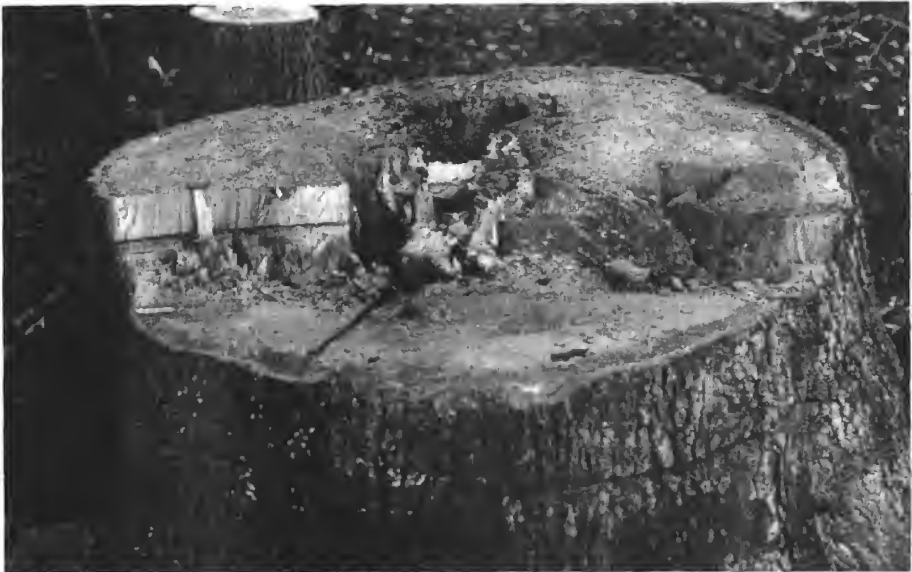
Fig. 3. Oak stump in north woods.

On the other hand, the loss of the northern woods demonstrates failures of omission as well as commission, in that scientific research on the area's unique ecology was apparently begun only at the penultimate moment when plans for its demise were well underway. Today, in Maryland and Virginia, are very large, rich woodland areas that are already "protected" to a greater or lesser degree: Cedarville State Forest, Little Bennet Regional Park, and Prince William Forest are examples. Yet, at a time of rocketing land values, when the region is undergoing an orgy of development, who can promise that these thousands of "unused" acres will not one day invite piece-by-piece encroachment? Not only is political vigilance required—no natural area should be complacently regarded as absolutely safe—but strategies for protection must be built into the enjoyment