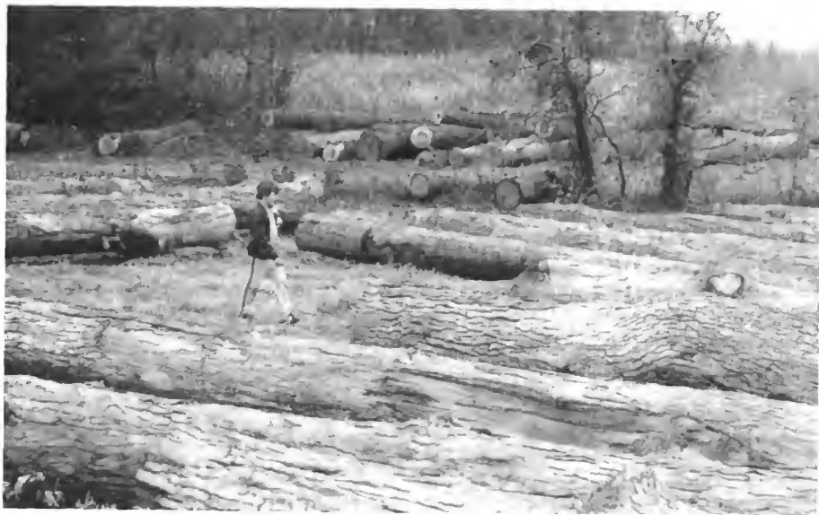
Fig. 4. Logs dragged to nearby field.

citizens already derive from these places. According to Robert Whitcomb, these protected forests will themselves become large-scale editions of Belt Woods years from now, viable, self-sustaining ancient forests, if they are allowed to maintain their integrity in size and natural development. A major strategy in this on-going campaign is the careful gathering of data on their flora and fauna, the compilation of complete biotic inventories of plants and animals that becomes the ammunition, so to speak, in future preservation efforts. Whitcomb pointed out that the 1947 bird census of Belt Woods by Chandler Robbins and Robert Stewart, and the follow-up in 1975, were instrumental in convincing public authorities of the woods' ecological significance. Many of these surveys can be and often are done by amateur naturalists, whose work has been invaluable for the protection of natural areas around the world.