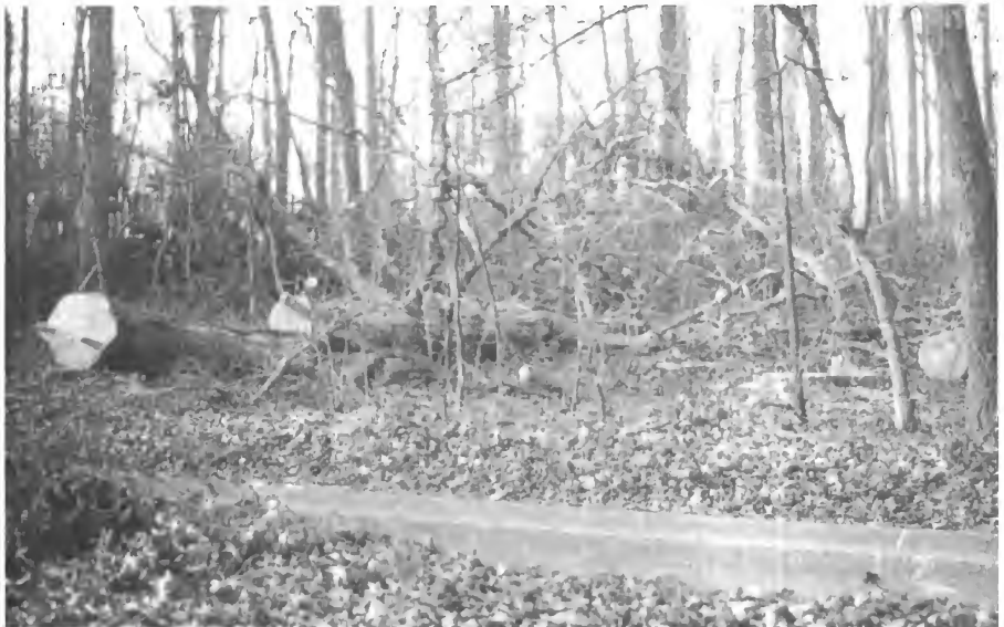
Fig. 2. Large oaks just after felling.

At that time, the diocese stated its intention of preserving the southern tract, already a National Natural Landmark, but the north tract was gone, which materially lessened the likelihood of the south woods remaining unchanged and its bird populations remaining stable. In a 1975 report to the District Council of Prince George's County, scientists and conservationists had urged that the northern section not be cut in order to prevent the isolation of the south parcel. Ecological research, they pointed out, "has clearly shown that habitats surrounded by other incompatible habitats support fewer species than comparable areas with large tracts of similar habitat." As is now known only too well, natural areas below