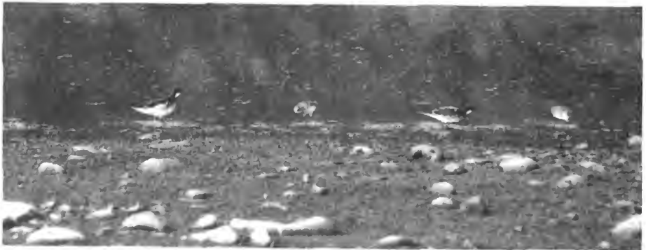
Fig. 1. Red-necked Phalaropes with Semipalmated Sandpipers at North Branch, Allegany County, June 1, 1987.

Dowitchers, Woodcock, Phalaropes. The last of the spring Short-billed Dowitchers were 14 at Ocean City on June 13, 12 there on June 21, and 9 on June 27 (Ringler); 16 were at Hart – Miller on June 14 and 7 were there on June 28 (Ringler +). Another Short-bill at Hart – Miller on July 3 fits the pattern for fall migrants though in this unusual year it could have been going either way. Certain fall migrant Short-bills were 10 at Blackwater on July 18 (Wierenga, Ringler) and 41 there on July 25 (Davidson, Wierenga), 40 at Hart – Miller on July 19 (Ringler +) and 80 there on July 31 (Blom), 1 at Cove Point on July 25 (Stasz) and 80 at Ocean City on July 26 (Ringler). An American Woodcock was flushed from the edge of a shopping center parking lot at 94th Street in Ocean City on June 6 and 13 (Ringler). Wilson's Phalaropes are rarely seen in the summer season but there was 1 at Ocean City on June 21 (Ringler), 1 at Hart – Miller on July 19 (Ringler +) and 3 there on July 31 with 1 Red-necked Phalarope (Blom).