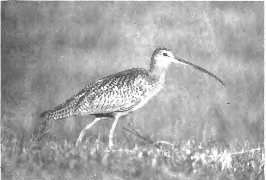
Sept. 1, 1987, Brandywine, Md.