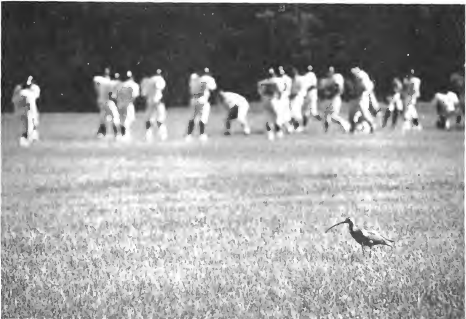
September 1987, Brandywine, Md.

The curlew's eyes were large and black, each surrounded by a thin cream ring. The head was buff with considerable burnt umber streaking on the crown, giving it a dark-capped look above the cream-colored supercilium. There was, however, a narrow central stripe of cream color in the crown. From some angles a thin, raw umber stripe was visible between the bill and eye. Behind the eye there was a thicker stripe of raw umber that merged into the crown and neck streaks. The chin and throat were a pale cream color, and the lower cheeks were buff. The long neck (up to twice the head length when fully extended) was buff, marked with thin cinnamon-brown streaks, more thickly at the back of the neck, setting off the paler head. These streaks extended to the upper breast, then grew broader and fainter, disappearing at mid-breast. The breast, belly, and vent were a uniform pale cinnamon. When the bird was preening, we could see that the flanks were cinnamon-rufous, and the wing linings were a bright, rich, cinnamon-rufous. The upperparts were burnt umber with buff spots; the primaries were darker and barred with sepia. The folded wing tips met over the end of the square tail, which was cinnamon barred with raw umber.