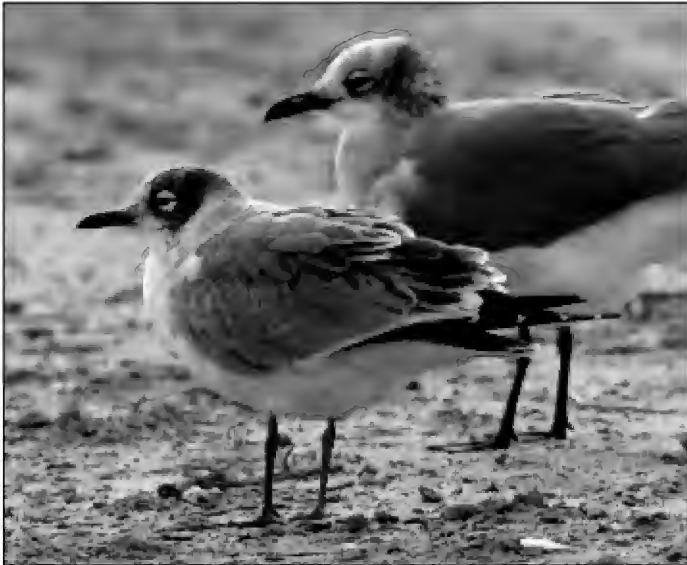
This diminutive first-winter Franklin's Gull, standing alongside a Laughing Gull, October 22 in Dorchester County.