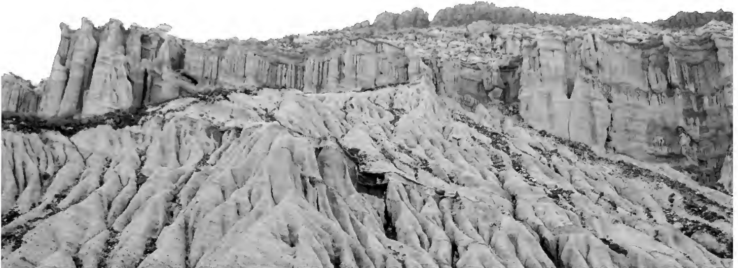
Red Rock Canyon State Park

Please meet at the Taco Bell at the SE corner of Hwy's 58 and 184 (Weedpatch Hwy) at 8:30 am for carpooling. We will leave promptly at 8:45 am. If you know the Preserve, you may meet us at the entrance at 9:00 am. We plan a 3-hour (plus or minus) visit, although if you want to stay longer, bring a lunch. There are no restrooms. The trail is gradual, and is appropriate for children or seniors, and short enough that you could leave early if you get tired. Please RSVP by deadline to contact listed above.