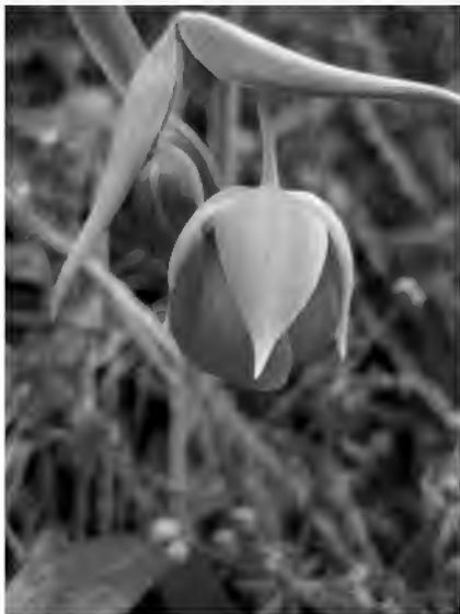
Calochortus amoenus (pink fairy lanterns)

Meet at the Denny's/ Starbucks on the corner of Merle Haggard and HWY 65, at 8 am for carpooling, leaving at 8:10 am, at the latest. Please park away from their doors. We drive up Granite Road to HWY 155 at Glennville, then farther on, park at the