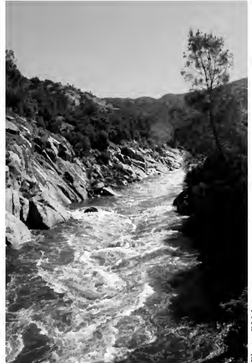
San Joaquin River Gorge

This will be an auto-tour type of field trip with frequent stops to see examples of woody plants associated with the blue oak woodland, bladderpod scrub, tentatively Tucker woodland and ephedra ( E. viridis ) scrub, scale broom scrub, creosote scrub, salt scrub, pinyon-juniper woodland, and Joshua Tree woodland. The trip will travel east on Highway 58, then north along a portion of Highway 14,