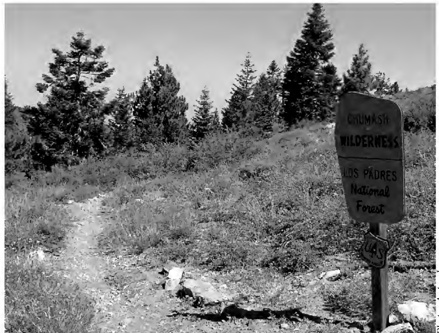
Chumash Wilderness, Los Padres National Forest

PRINT OR SAVE THESE DATES TO YOUR CALENDAR!