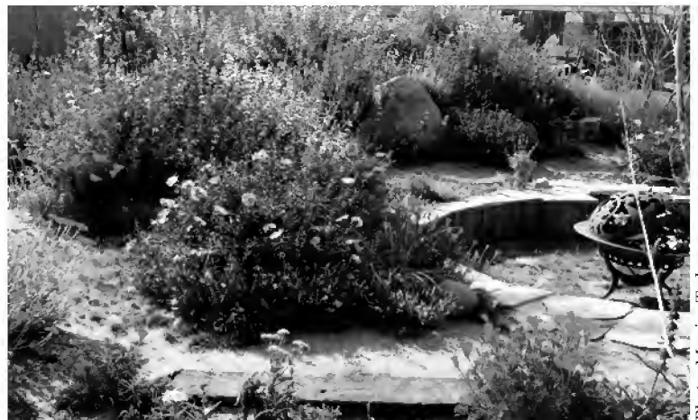
The happy survivors.

The casualty rate during the first summer was about 90%. First to die were the toyons and manzanitas. The blue oak hung in for a year and then croaked too. Half of the sages clung to life but were looking