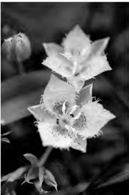
Calochortus westoni (Shirley Meadows star tulip)