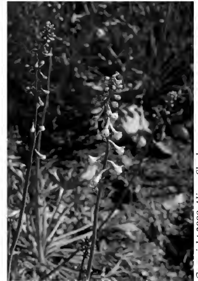
Unexpected Larkspur ( Delphinium inopinum )

Saddle Springs Road turns off Bodfish-Caliente Road (Lake Isabella Blvd). It is a rough narrow road that has few turnouts, so carpooling is mandatory. High-clearance vehicles are required.