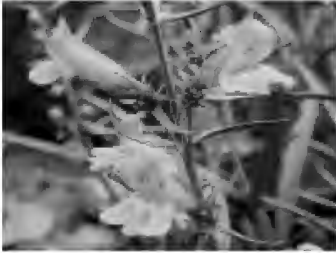
Penstemon heterophyllus "Margarita BOP" – Foothill Penstemon

These plants produce an abundance of brilliant purple/blue or red flowers. Here are a few that might be available at the Native Plant Sale at FACT November 3, 2007.