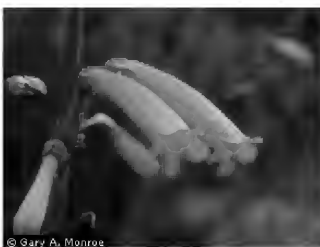
Penstemon centranthifolius – Scarlet Bugler