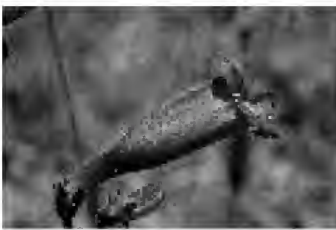
Penstemon laetus – Mountain blue penstemon