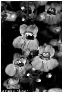
Penstemon spectabilis – Showy penstemon