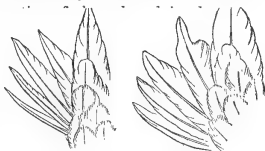
S. RUFES, ♂.

Male. Top of head and back bronzy-green, dulled on the forehead. Sides of the head, rump, flank, abdomen, and under tail-coverts rufous. A gorget of metallic feathers, covering all the throat and extending on to the sides of the neck, brilliant coppery-red, with brassy reflections in certain lights. Upper part of breast white. Wings purplish-brown. Tail short, cuneate,