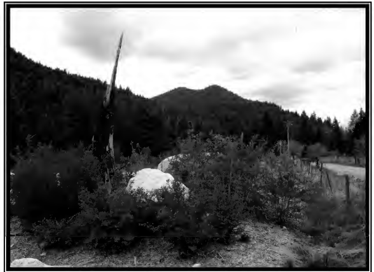
Before and after construction and planting of a parking lot. Photos part of Kinnikinnick Chapter's November 2007 program.