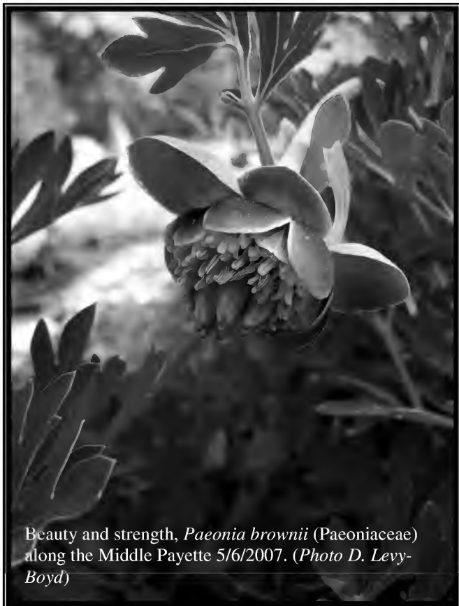
Beauty and strength, Paeonia brownii (Paeoniaceae) along the Middle Payette 5/6/2007.

One of our most popular events, our annual native plant sale is a gardener's delight. Details TBA. Volunteers are needed so please contact Ann DeBolt if you are interested in helping ( rosebolt at clearwire.net ).