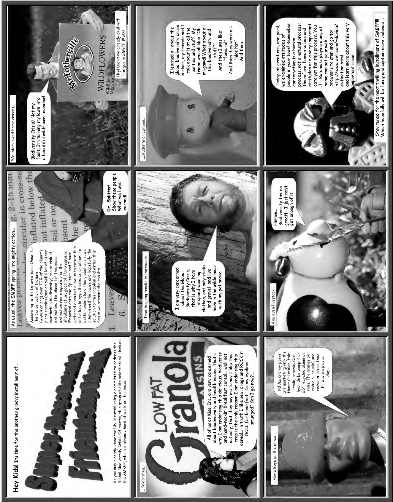
By Kent Fothergill