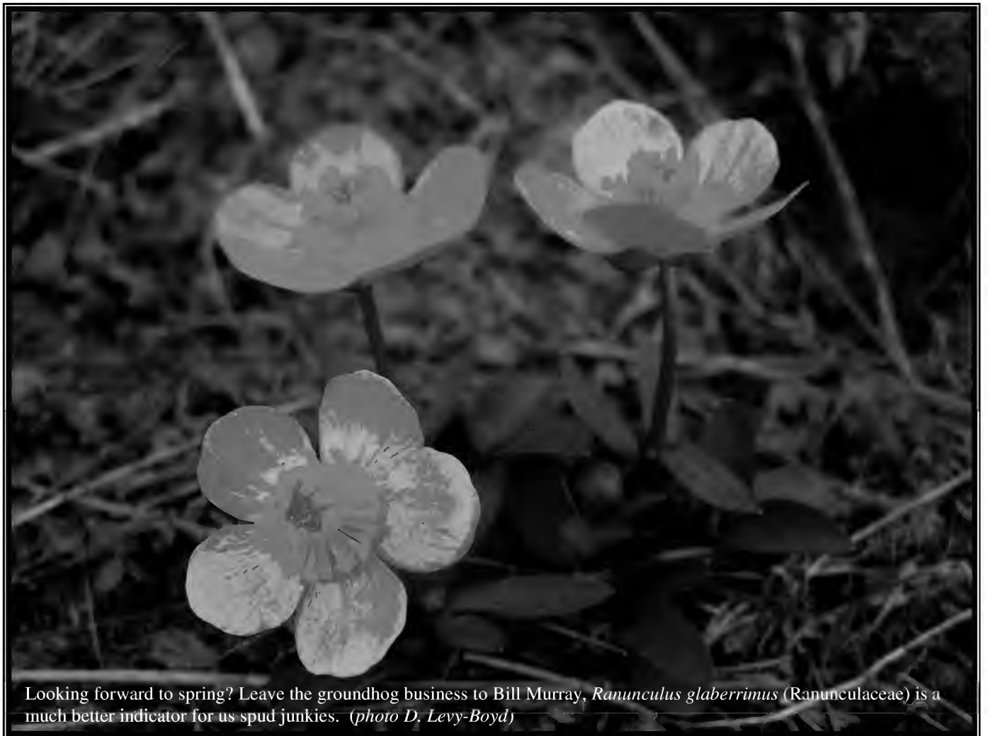
Looking forward to spring? Leave the groundhog business to Bill Murray, Ranunculus glaberrimus (Ranunculaceae) is a much better indicator for us spud junkies.