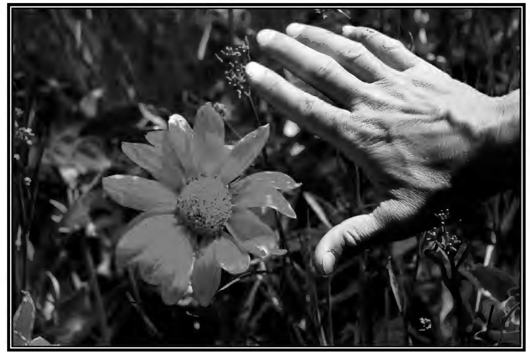
Balsamorhiza macrophylla from the Bear River Range.

Overall, we found the plants in the Bear River Range to be botanically rich and diverse. It is a region that deserves much more attention with respect to plant discovery and collection. Table 1 summarizes the collections made in the Bear River Range in 2008. Total species collected came to 49. Multiple collections of some species brought the accession total to 67.