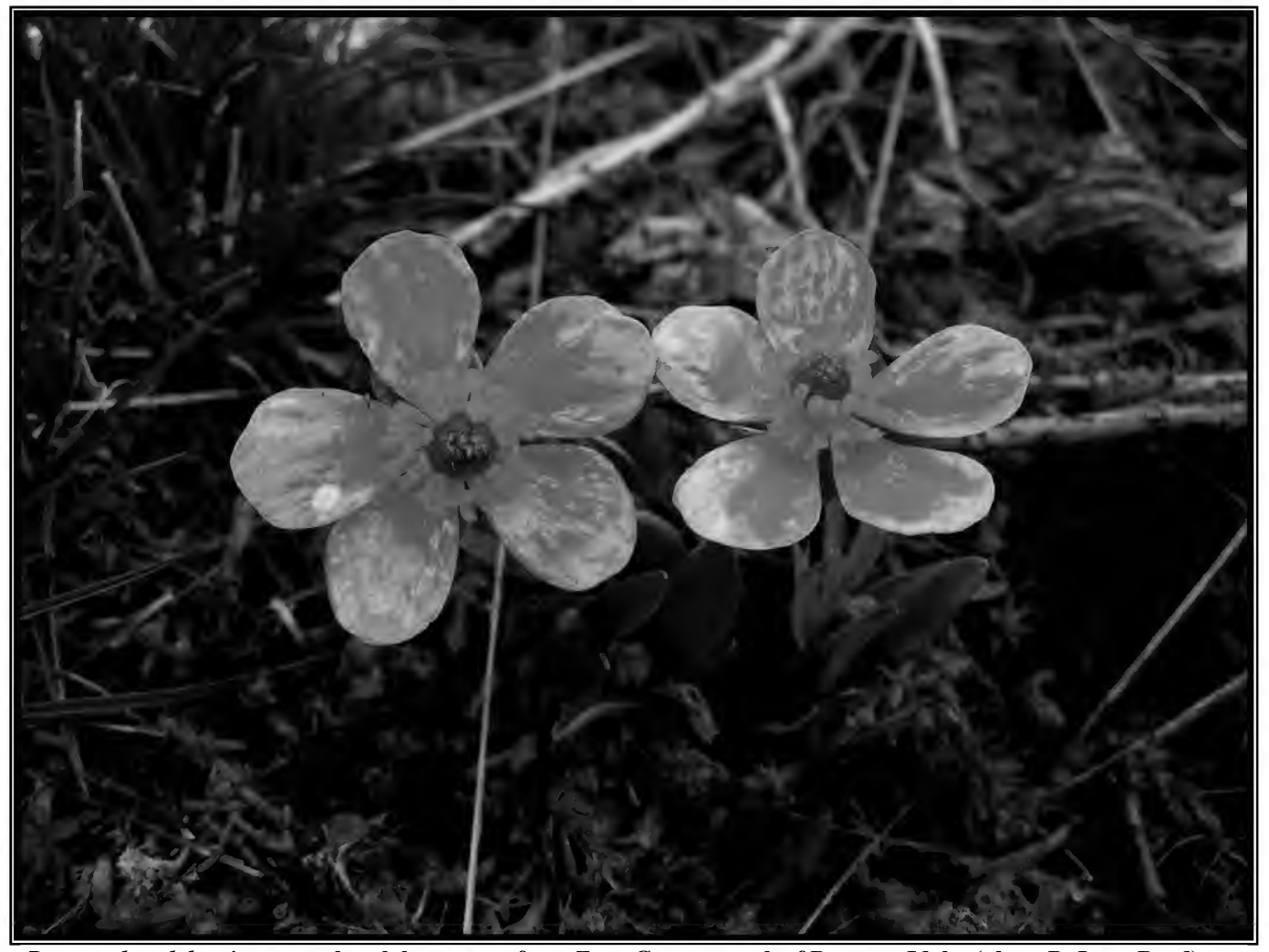
Ranunculus glaberrimus, sagebrush buttercup, from Zeno Canyon south of Bruneau Idaho.