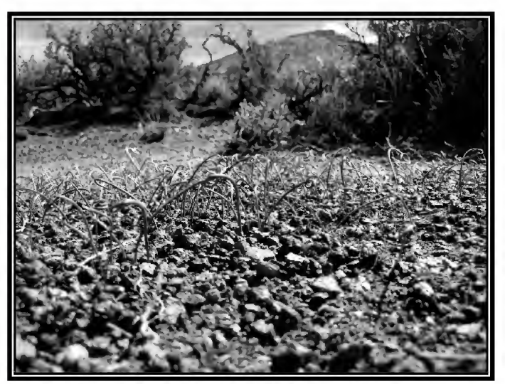
Fields of Allium spring forth from rocky soils in the Bruneau Canyon area

June 6, 2009 - Clearwater Disjuncts with leader Pam Brunsfeld of the UI Stillinger Herbarium. Meet at 7:30 AM at Eastside Marketplace, South parking lot. This will be an all day trip along first the Clearwater and either the Selway or Lochsa River (more details in later announcements). We may see dogwoods if they are still in bloom. The primary focus will be on the Clearwater disjuncts. This is an all day trip so prepare accordingly and wear appropriate clothing and shoes for river canyon habitats.