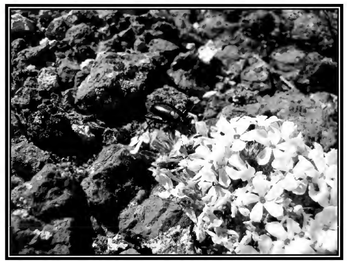
A Tenebrionid beetle takes interest in Phlox hoodii , in the Bruneau.

http://www.boisestate.edu/biology/idahobotforaypost.shtml.