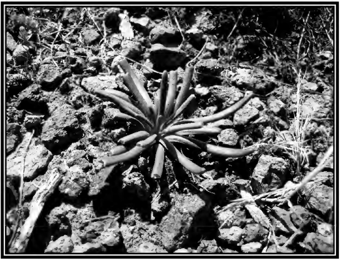
Come May look for amazing wildflowers like this bitter root, Lewisia rediviva , in the Bruneau Canyon Country (photographed 4/12/09, D. Levy-Boyd)

opportunity to see forbs we do not often see on field trips. Bring water, snacks.