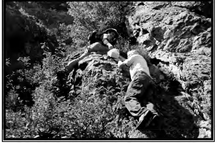
The authors overcame steep terrain and persistent snow while collecting 47 natives in the Bear River Range.

{Articles contributed to Sage Notes reflect the views of the authors and are not an official position of the Idaho Native Plant Society}