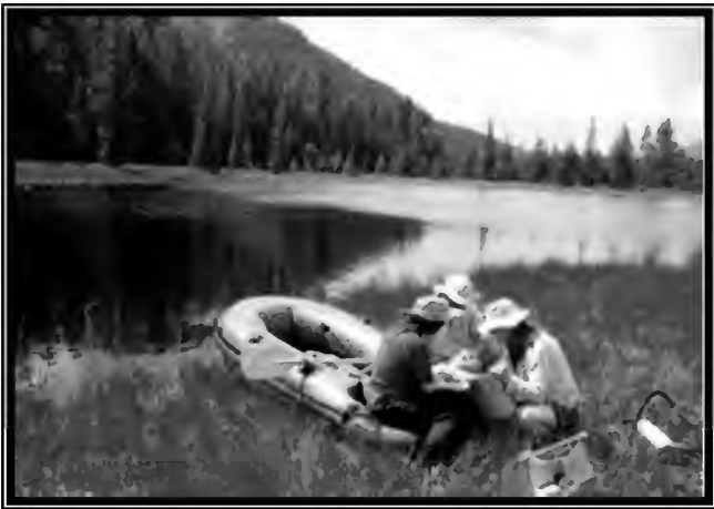
Class members picking invertebrates from samples collected along mat edge.

A fixed sphagnum mat occurs north of the lake. It is characterized by intermediate fen vegetation. Dominant vascular species were slender sedge ( Carex lasiocarpa ), and dulichium ( Dulichium arundinaceum ). Bursik found two rare species in this community: inundated clubmoss ( Lycopodiella innundata ) and St. John's wort ( Hypericum majus ), a very small, low growing plant not seen. Lycopodiella is now considered a common species.