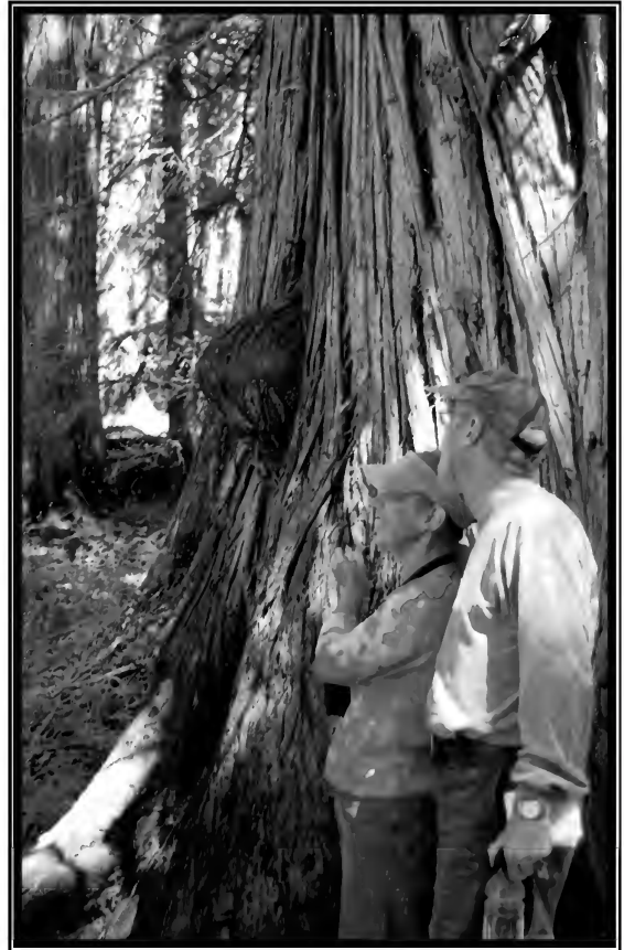
INPS visitors of the Hobo Cedar Grove marvel at giant, ancient, western redcedar trees