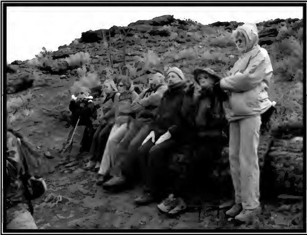
Upper Snake Chapter members bundled up for a spring hike around North Menan Butte.

April 24, 2010 – Earth Day at Tautphaus Park. Volunteers at the booth kept busy helping children and adults plant seeds in the biodegradable pots that we had made at our previous meeting. We gave out seeds for seven native species including Indian rice grass ( Achnatherum hymenoides ) and arrowleaf balsamroot ( Balsamorhiza sagittata ), and discussed