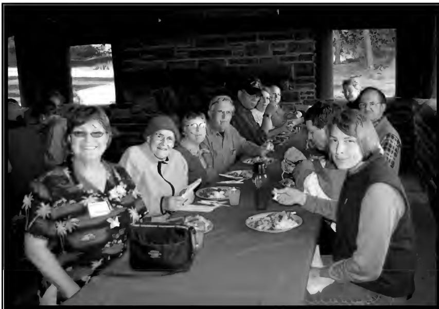
INPS members and guests share the catered 2010 Annual Meeting dinner at Chatcolet Shelter