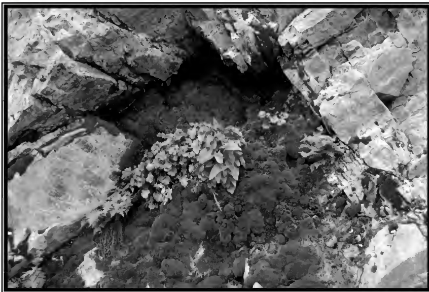
A profusion of coastal disjunct species in rocky Big Creek terraces

In the overstory of the unusually cool, lush forests around Big Creek, we noticed disjunct species western redcedar ( Thuja plicata ) and western hemlock ( Tsuga heterophylla ), along with Douglas-fir ( Pseudotsuga menziesii ), grand fir ( Abies grandis ), and western white pine ( Pinus monticola ) throughout this inland refugium. The diverse shrub layer contained oceanspray ( Holodiscus discolor ), Rocky Mountain maple ( Acer glabrum ), red-osier dogwood ( Cornus sericea ), Scouler’s willow ( Salix scouleriana ), and Prunus emarginata var. mollis , the disjunct tree variety of bittercherry. Bracken, lady, and sword ferns ( Pteridium aquilinum , Athyrium filix-femina , and Polystichum munitum ) and abundant mosses filled the understories of the gentle slopes and stream terraces. Closer to the earth, broadleaf starflowers ( Trientalis latifolia ), clustered lady’s slippers ( Cypripedium fasciculatum ), white shooting stars ( Dodecatheon dentatum ), and the rare Constance’s bittercress ( Cardamine constancei ) bloomed later than usual, after the cool, wet spring.