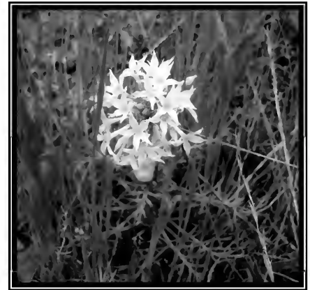
A white form of scarlet gilia ( Ipomopsis aggregata) found in McCroskey State Park

Along with their families and friends, over 55 members attended the successful 2010 Annual Meeting of the Idaho Native Plant Society (INPS), held this year at Heyburn State Park, near Plummer, Idaho, on Friday, June 11, through Sunday, June 13. Several participants arrived on Thursday to enjoy the deep forests and quiet waters of the reserved campground on Lake Chatcolet, while many members enthusiastically converged with their colleagues from across the state by Friday evening. Most members stayed through Sunday evening or Monday morning, participating in a dozen activities hosted by the White Pine Chapter. All of us who experienced this exuberant, sunny weekend together will remember the gathering as a bright spot in our shared quest to better understand and appreciate the bountiful natural wonders of Idaho and the good people who know and love its botanical treasures.