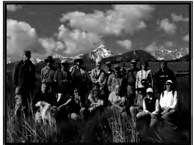
Upper Snake Chapter members on a June field trip to the foothills of the Lemhi Mountains.

June 26, 2010 – Birch Creek Valley/Foothills of the Lemhi Mountains. A sunny day brought out the enthusiasts to check out marsh plants by the creek and completely different plants on the dry hillsides a few feet away. Among many others, we found 3 species of vagrant lichen and blue-eyed grass. It was interesting to check out the Charcoal Kilns and learn about the history of the area. Many thanks to leaders Rose Lehman and Wendy Velman.