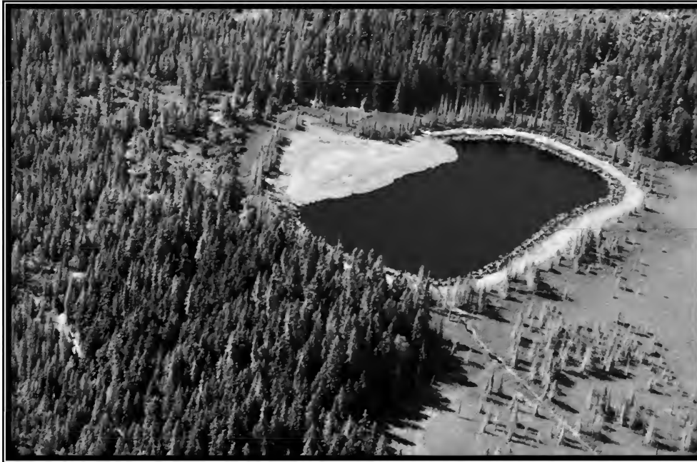
Hager Lake, near Priest Lake Ranger Station, was formed about 12,000 years ago by retreating glaciers that left ice buried in the drift. The ice eventually melted leaving a depression 27 ft deep and 5 acres in size.

The middle of the basin north of the lake was covered by a rich fen community co-dominated by slender