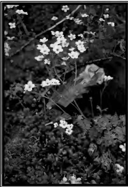
Saxifrage blooming in the damp cliffs over Big Creek

Some big changes that have happened since I took office in 2009 have impacted the Society. Our Sage Notes editor moved (Thanks Dylan for the continued support). We hosted the first Native Flora Workshop, we lost a chapter, and added a new chapter.