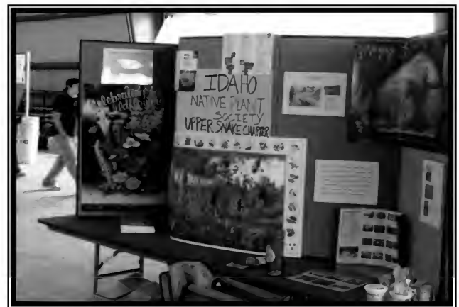
Upper Snake Chapter booth at the Earth Day event at Tautphaus Park on April 24, 2010.