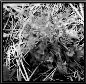
Sundew ( Drosera anglica )

Mount Mazama tephra near the top of the lake sediments below the mat.