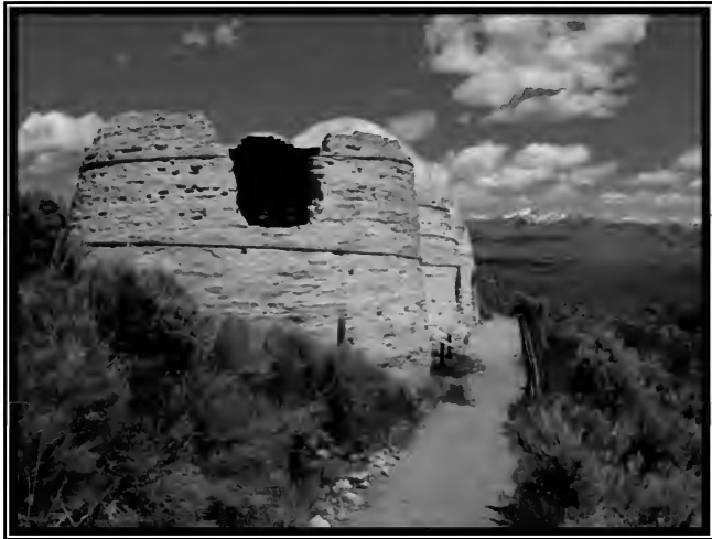
Charcoal kilns in the Birch Creek Valley/Foothills of the Lemhi Mountains.