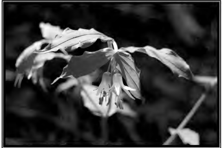
Hooker's fairy-bells ( Disporum hookeri) growing in the shady Hobo Cedar Grove understory

I have guilt in my decision to step down as president because I will be leaving the Society in a hard position with no President or Vice-President. I do