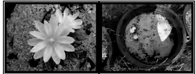
Baby bitterroots ( Lewisia rediviva ).