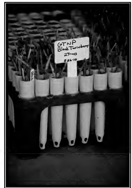
Native seedlings developed in the Plants of the Wild nursery for a restoration project

Wandering outside into the intense Palouse sunlight, we noticed hundreds of more mature native shrubs and trees flourishing in crowded rows of large pots. Intermingled with spindly willows, black cottonwoods, ponderosa pines, and western larches, slim bushes of serviceberry, syringa, red osier dogwood, and silver buffaloberry huddled in containers. Commenting on the wide variety of appropriate habitats represented by these species, we discovered that these plants ultimately bring some natural beauty and wildness back to altered environments in places ranging from the Great Basin to the Pacific