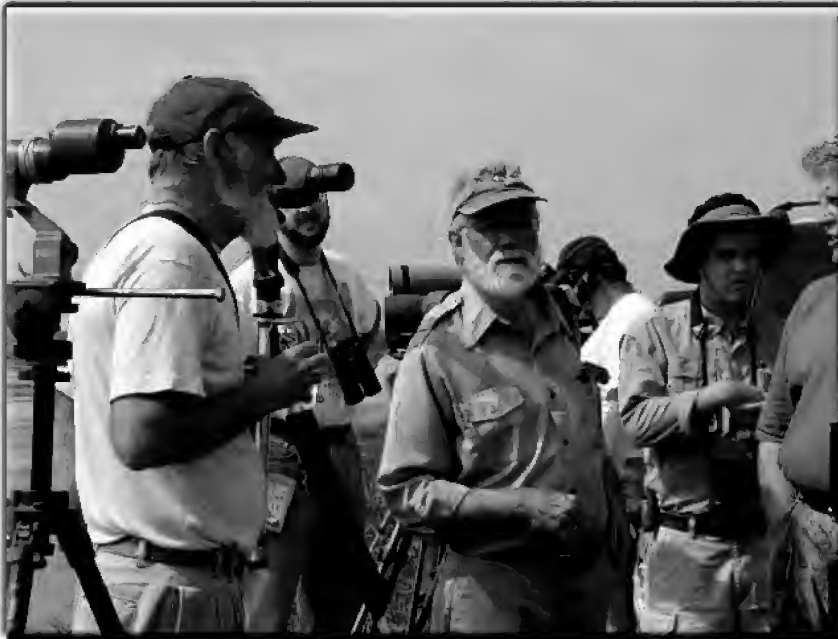
Shorebird Workshop at the Pits in 2005