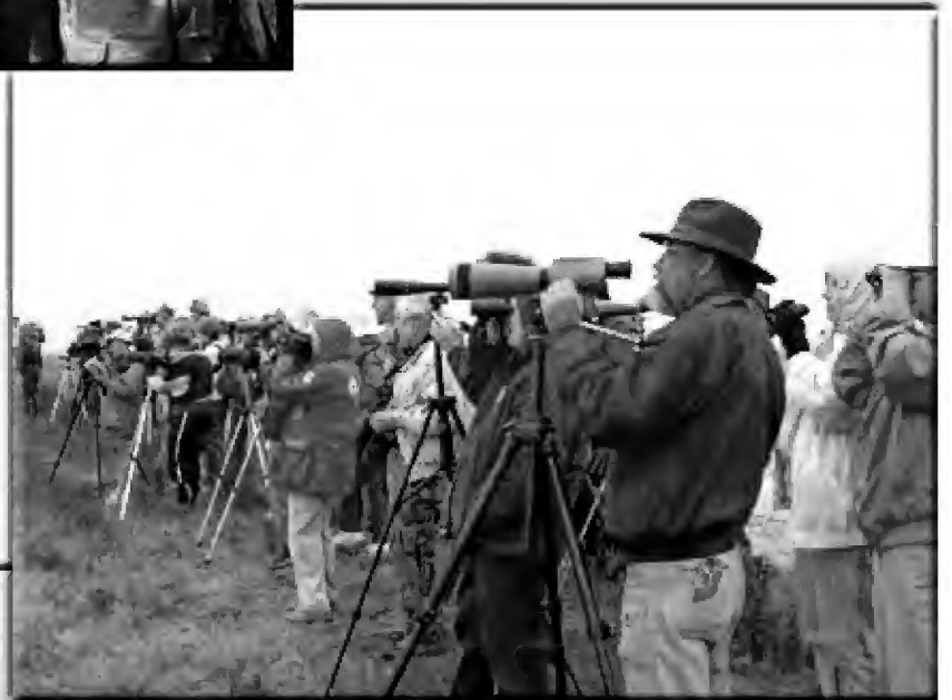
AOS Meeting, Dauphin Island. 4-93