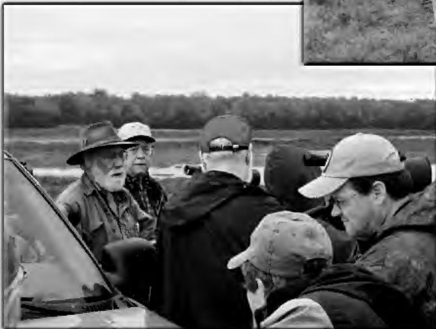
2008 TOS Spring Meeting-Pits