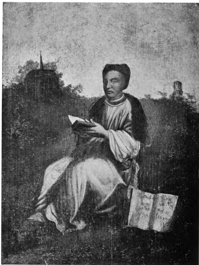
THOMAS A KEMPIS