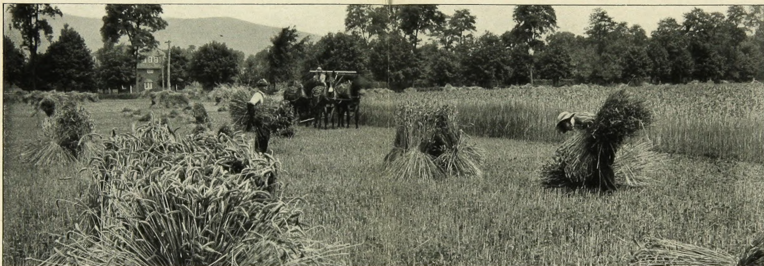
Magnificent crop of St. Louis Grand Prize Wheat growing for seed, 1912. This shows the wonderful yielding possibilities of this grand Wheat. Get your order in early for it.

Prices of Fultz-Mediterranean: 2 to 8 bus. at $1.75 per bus.; 10 to 30 bus. at $1.70 per bus.; 32 to 50 bus. at $1.65 per bus.