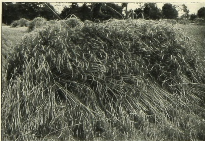
Silver Sheaf Longberry Red. It produces the longest heads of all Wheat and very long straw. A bearded Wheat of greatest value.

Either sows all kinds of clover, grasses and grains.