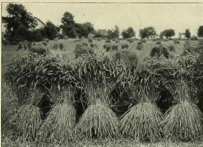
The seed from this field of Red Wave is one of the crops we are offering our customers. Note closely the immense size of all the heads.