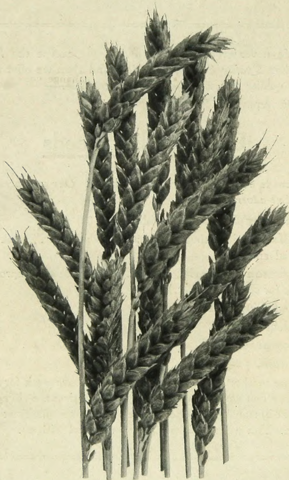
Heads of St. Louis Grand Prize. Get your share of the extra dollars by putting out your entire seeding of this big yielder (About one-third natural size)

“This is the largest and grandest crop of Wheat I ever grew. I wish I had bought all my seed from you. Everybody is praising it. The heads are wonderful. I believe it will give fifty bushels to the acre.”