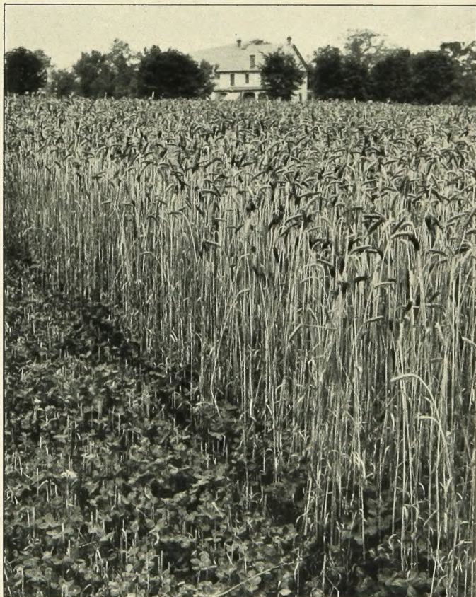
St. Louis Grand Prize. The heads are so large that they can be seen in the above photograph almost to the extreme end of the field. Our seed will produce just such crops for you—two bushels where one grew before.

Prices of Fulcaster: 2 to 8 bus. at $1.75 per bus.; 10 to 30 bus. at $1.70 per bus.; 32 to 50 bus. at $1.65 per bus.