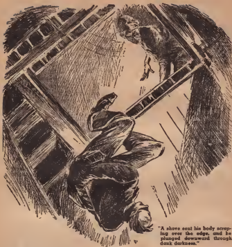
"A shove sent his body scraping over the edge, and he plunged downward through dark darkness."

eyes held Ennis'. "Did you ever hear of an organization called the Brotherhood of the Door?"