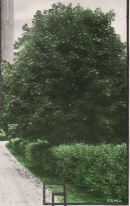
AMOR RIVER PRIVET (LIGUSTRUM AMURENSIS) THE ONE HARDY PRIVET