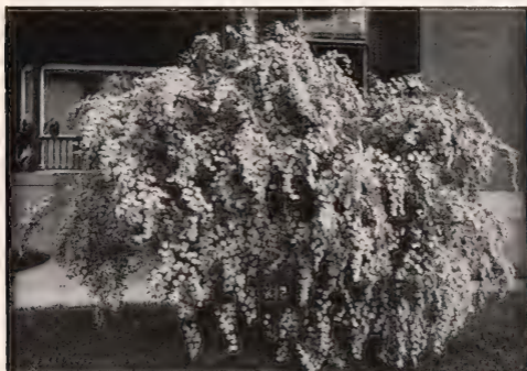
Spirea Van Houttei.