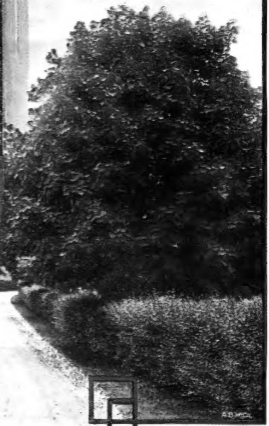
AMOR RIVER PRIVET (LIGUSTRUM AMURENSIS) THE ONE HARDY PRIVET