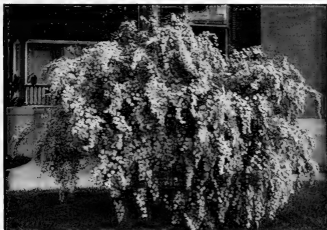
Spirea Van Houttei.