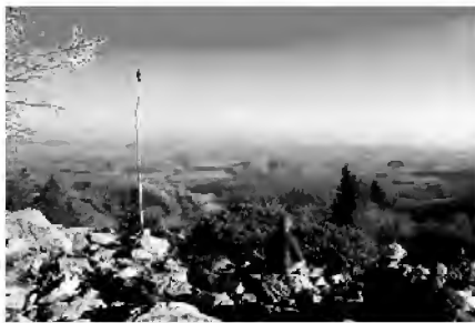
Looking North from Hawk Mountain (North Lookout with owl decoy HMS collection)