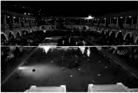
Welcome social at 2006 NAOC