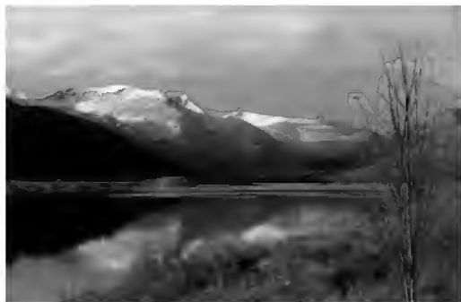
Along the road to Skye

The RRF 2009 annual conference will be held overseas for the first time, to reflect the global interests of its membership. Hosted by the Scottish Raptor Study Group, this event will be held in an exclusive hotel in the small town of Pitlochry, central Scotland, with a full program of scientific presentations, workshops and seminars. Social events include the hire of a nearby castle