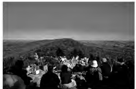
Visitors at North Lookout, Hawk Mountain (NLO on clear day)