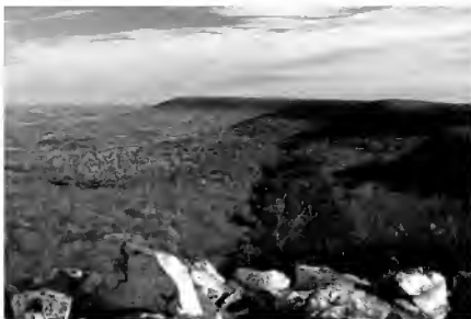
View from Hawk Mountain