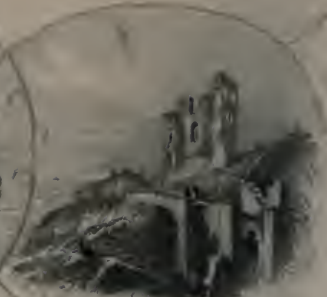
LEAR ROUGH CASTLE