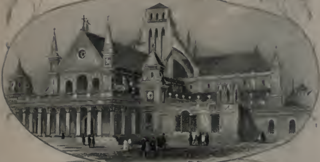
OLD ST. PAULS