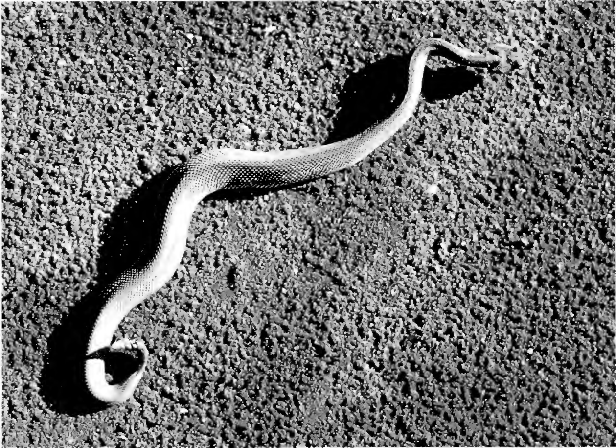
Fig. 1. Aberrantly patterned juvenile western diamondback rattlesnake acquired from Haskell County, Texas. Faint longitudinal stripe appears to be the result of blotch pattern transformation. Snout to vent length of this specimen is 450 mm.

northern pacific rattlesnake ( C. v. oreganus ), the southern pacific rattlesnake ( C. v. helleri ), the Panamint rattlesnake ( C. mitchellii stephensi ) (Klauber, 1972), and the western massasauga ( Sistrurus catenatus tergimimus ) (Irwin, 1979). However, in aberrant individuals of these taxa, the longitudinal stripe only extends two-thirds the length of the body or less (Klauber, 1972; Irwin, 1979). Complete blotch transformation (longitudinal stripe from head to tail) in rattlesnakes formerly was known only on the basis of four individuals. One was a timber rattlesnake ( C. horridus ) reported by Gloyd (1935). Interestingly, the other three were western diamondbacks from Texas, one from Bexar County, one from adjacent Comal County, and the other from an unknown place in southeast Texas (Gloyd, 1958; Klauber, 1972). In addition, Tennant (1984) reported that in 1981 two "almost patternless cinnamon-gray" specimens were collected from the Williamson County area of Texas, which