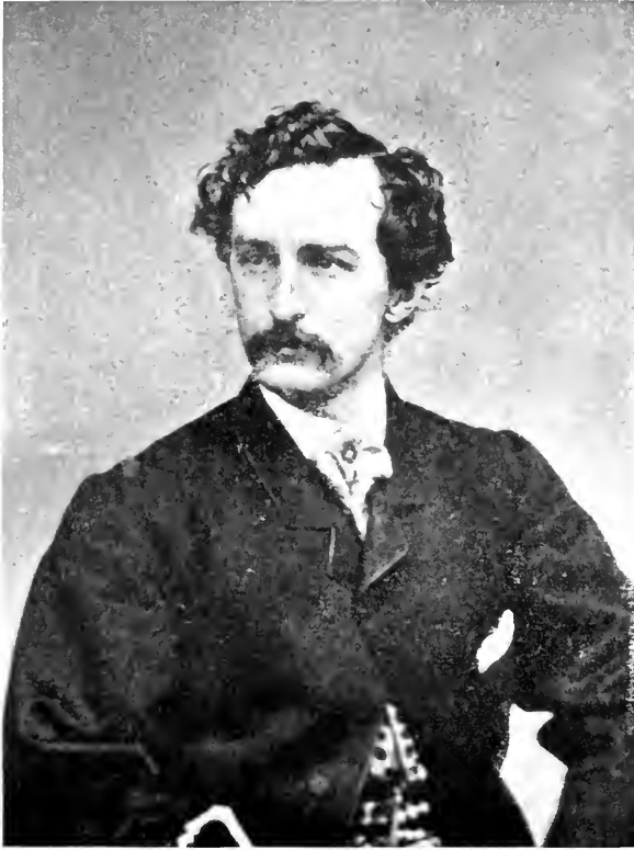
JOHN WILKES BOOTH—WHO SHOT PRESIDENT LINCOLN, APRIL 14, 1865