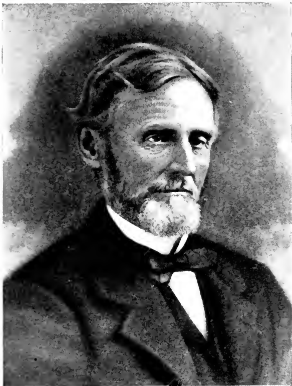
JEFFERSON DAVIS, CAPTURED AT IRWINSVILLE, GA., MAY 10, 1865.