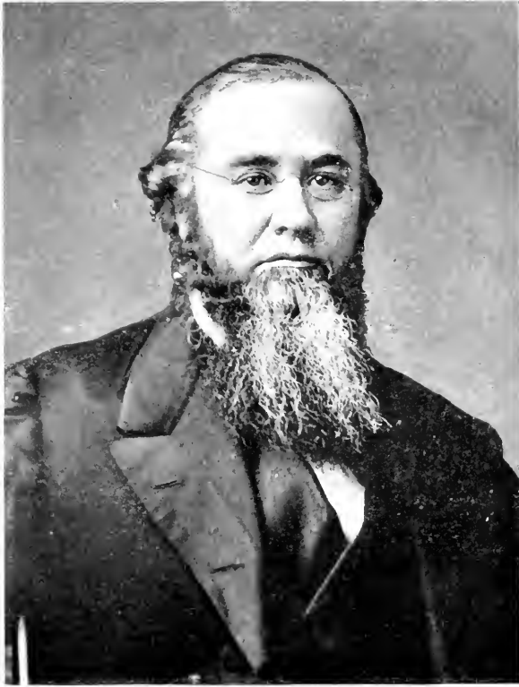
EDWIN M. STANTON, SECRETARY OF WAR 1865.