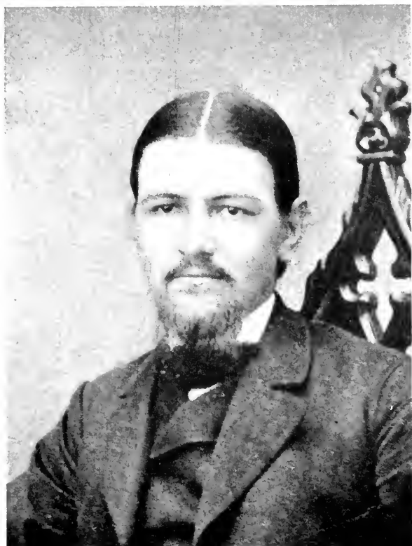
BOSTON CORBETT, WHO SHOT BOOTH, APRIL 26, 1865.