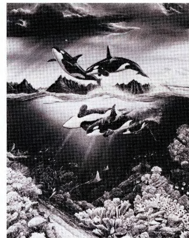
“Sea of Magic”