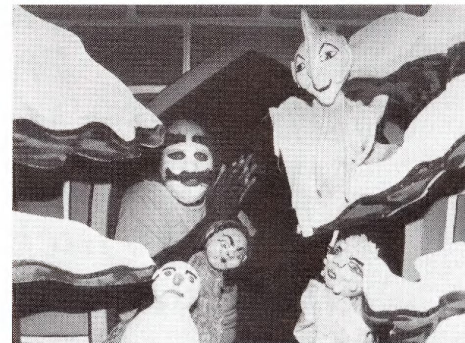
Mascaritas Puppet Theater

Experience traditional dance, folktales, music and foods from other lands without leaving San Francisco! Traditional Arts programs introduce visitors to cultures from all over the world every Saturday at 1:00 p.m. in Wattis Hall of Human Cultures. These programs are made possible through a generous gift from the Paul L. and Phyllis Wattis Foundation. For more information, call (415)750-7142.