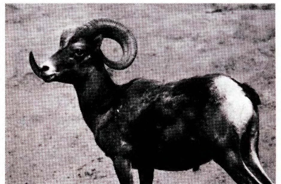
Desert Bighorn Sheep

One of the largest unbroken sections of wilderness remaining in the continental United States, the California Desert, is in peril. A new exhibit at the Academy describes the beauty and natural diversity of the desert with the hope of inspiring greater social consciousness of this fragile ecosystem. The exhibit features photo-murals of the unique desert archipelago systems (such as dunes, playas, springs and mountains) and graphic panels that depict escalating human impacts on the desert environment. Low-impact desert use and beneficial effects of restoration and protection efforts are emphasized. Interactive displays, the Desert at Night and Lowland Desert, feature slide-up panels that reveal hidden desert inhabitants typically camouflaged or nocturnal. The Vanishing Desert will be on display in the Academy's Hohfeld Hall from March 3 to June 2. For more information on the exhibit, please call 750-7142.