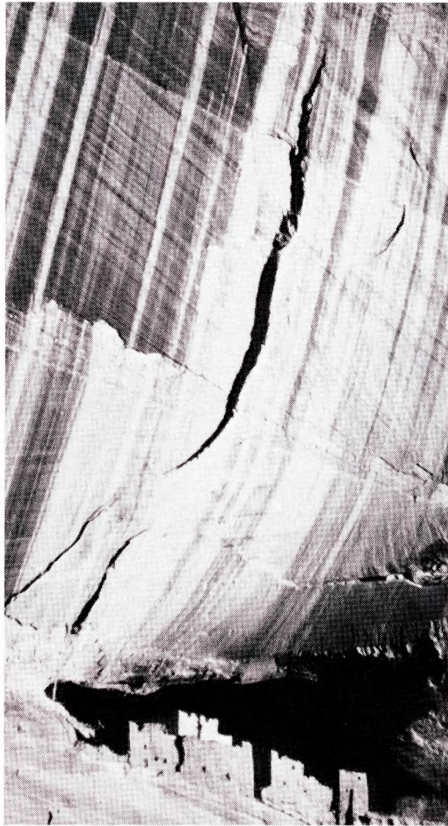
White House Ruin, Canyon de Chelly